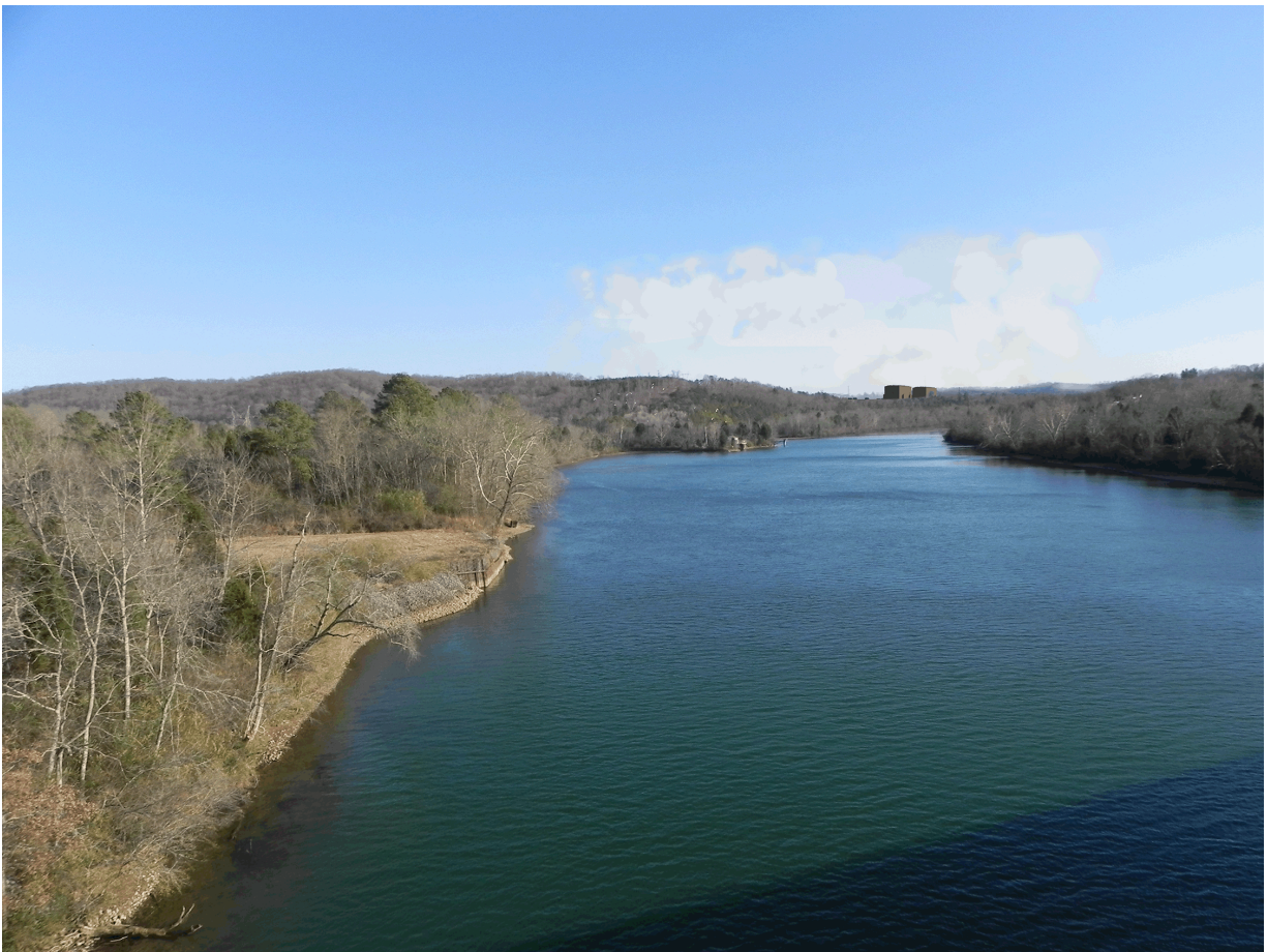
Figure 5.8-29. View from KOP 40 with the CR SMR Project and the Winter Plume