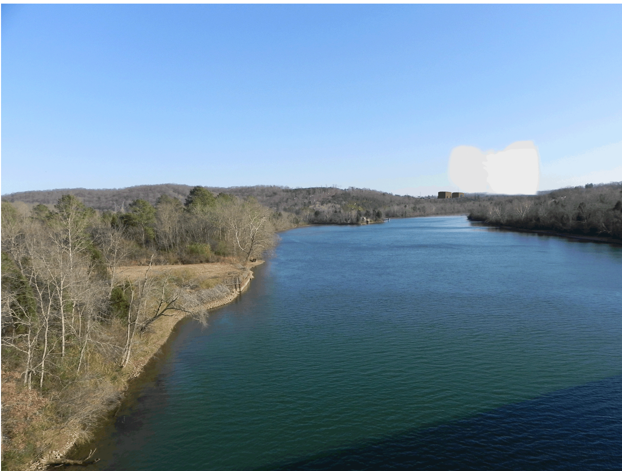
Figure 5.8-28. View from KOP 40 with the CR SMR Project and the Average Annual Plume