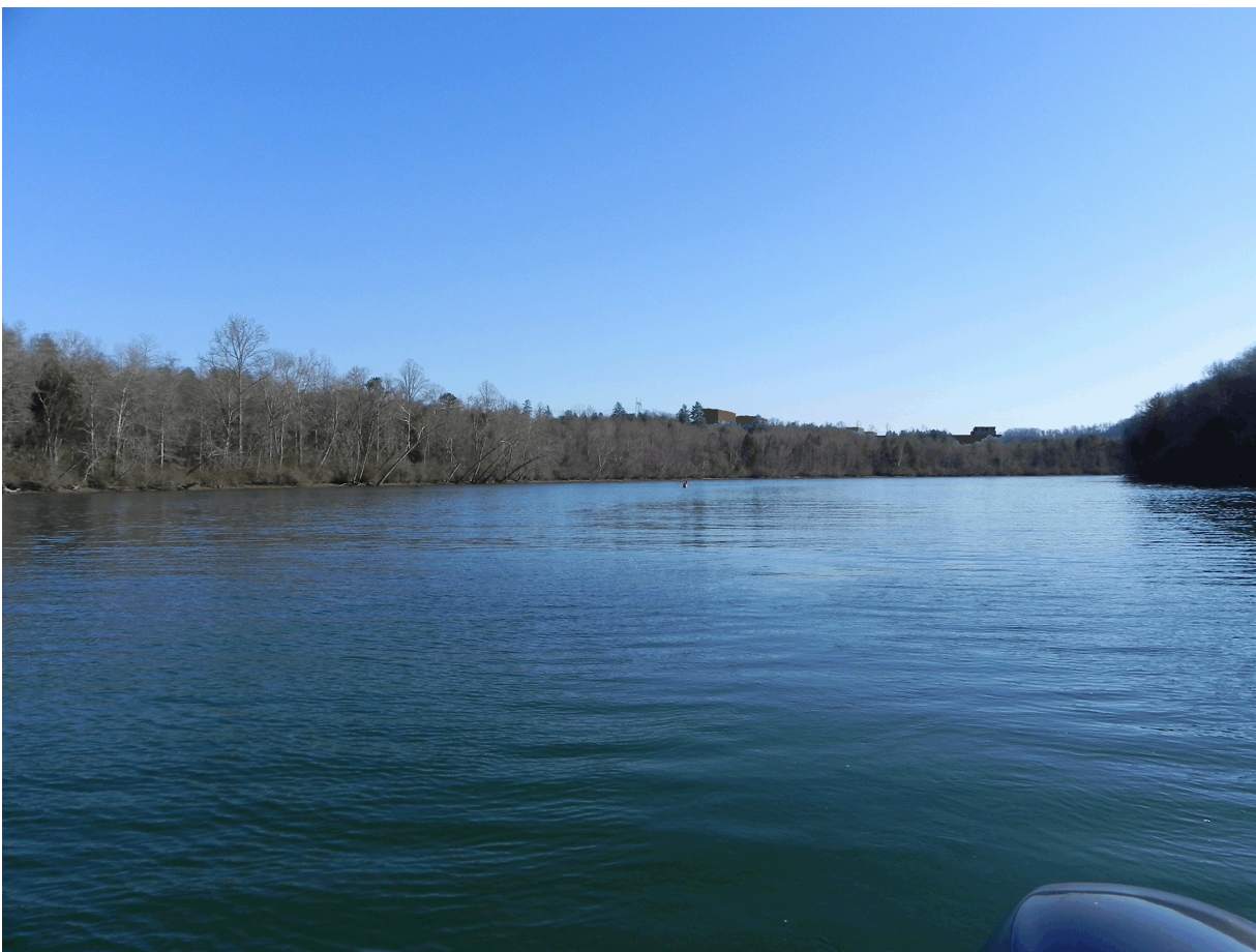
Figure 5.8-19. View from KOP 19 with the CR SMR Project