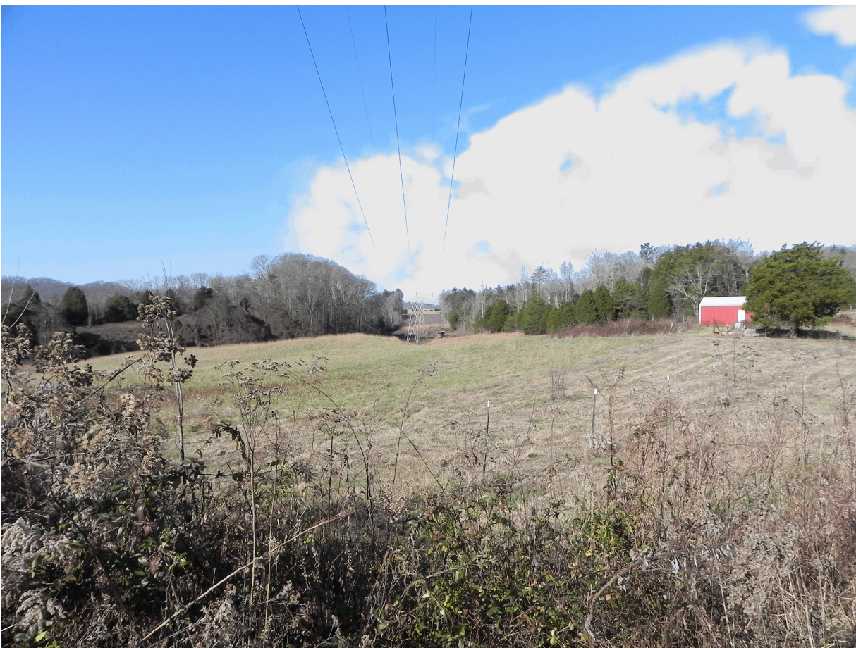
Figure 5.8-13. View from KOP 8 with the CR SMR Project and the Winter Plume