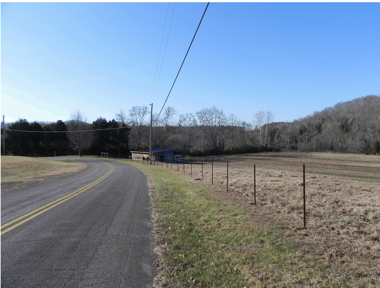
Figure 5.8-2. Baseline View from KOP 5