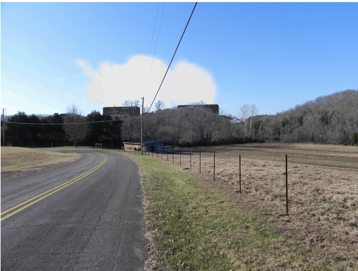
Figure 5.8-4. View from KOP 5 with the CR SMR Project and the Average Annual Plume