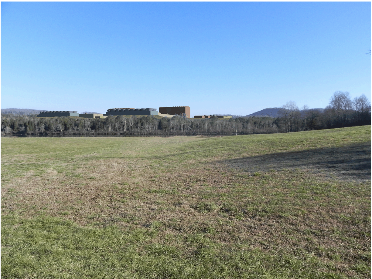
Figure 5.8-15. View from KOP 16 with the CR SMR Project