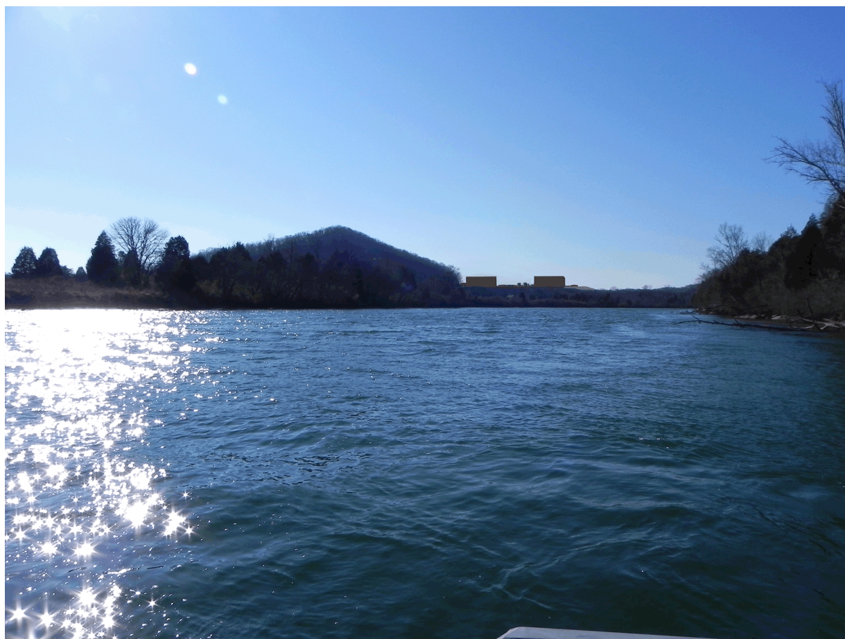
Figure 5.8-23. View from KOP 22 with the CR SMR Project