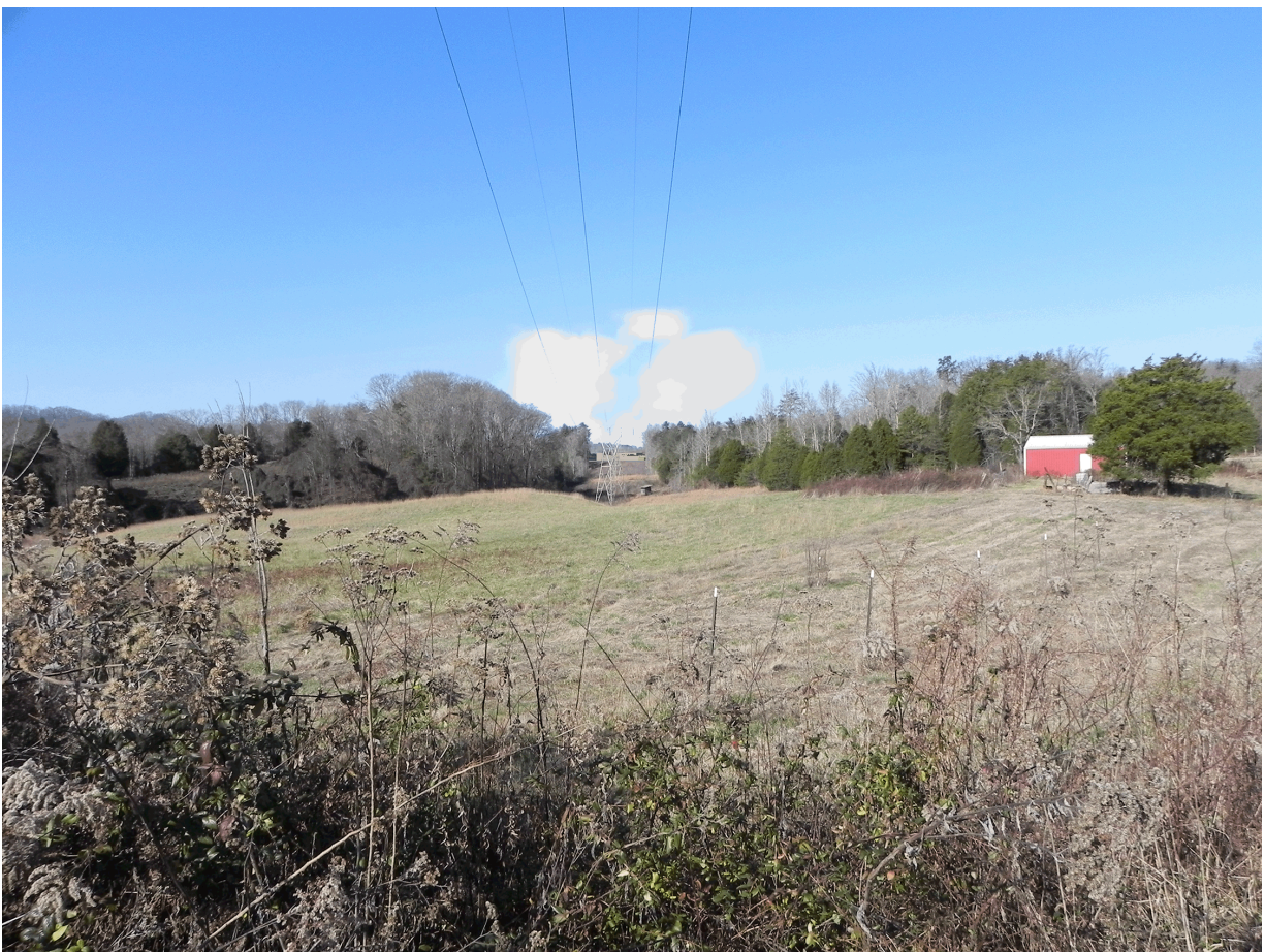
Figure 5.8-12. View from KOP 8 with the CR SMR Project and the Average Annual Plume