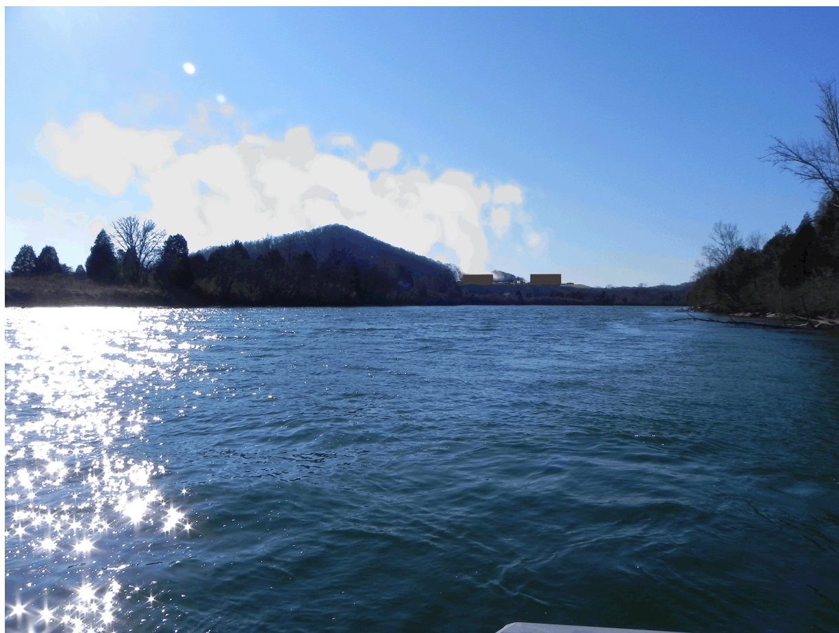
Figure 5.8-25. View from KOP 22 with the CR SMR Project and the Winter Plume