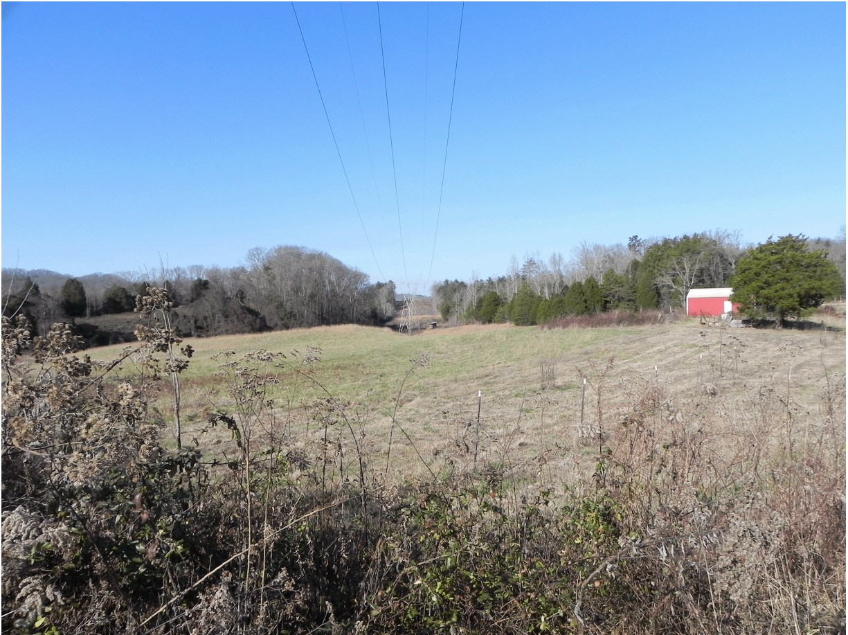
Figure 5.8-10. Baseline View from KOP 8