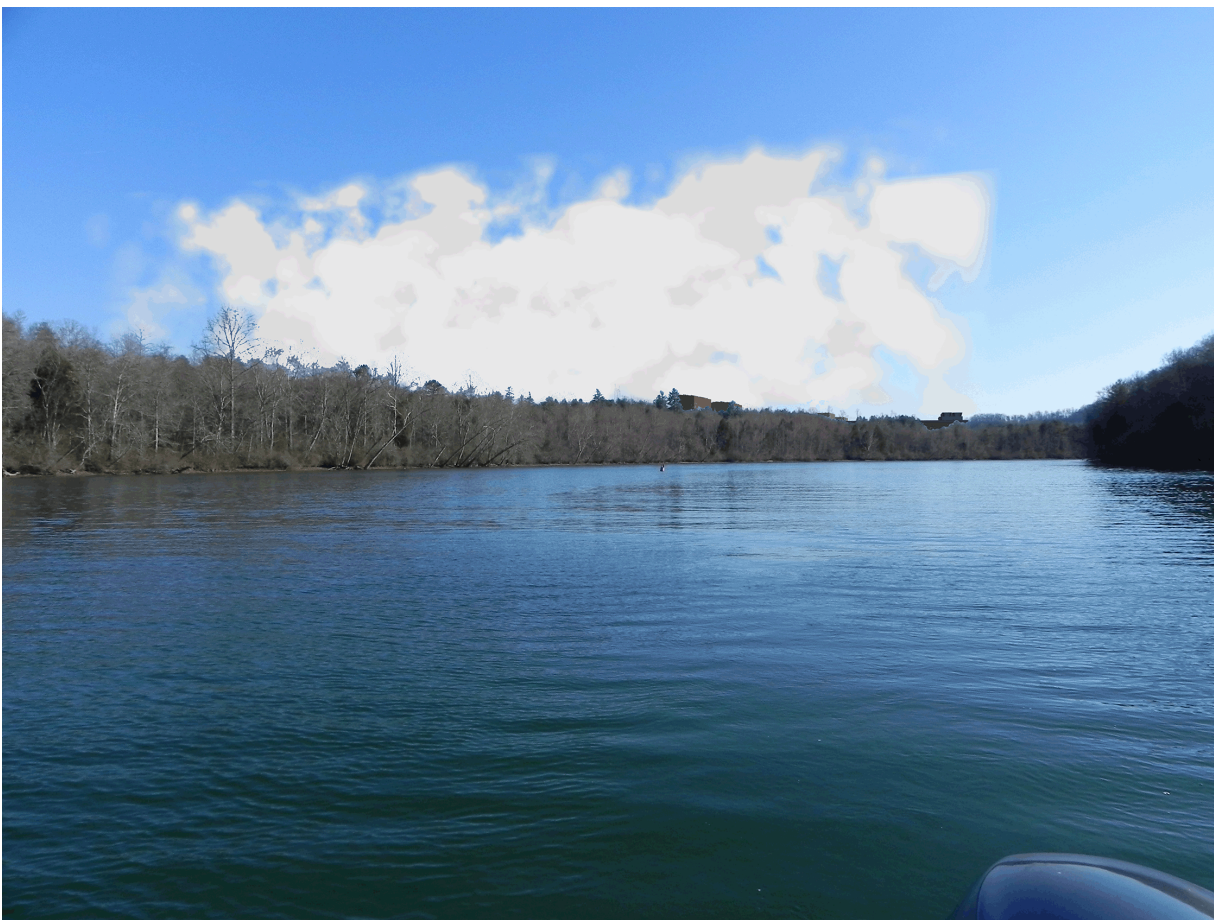
Figure 5.8-21. View from KOP 19 with the CR SMR Project and the Winter Plume