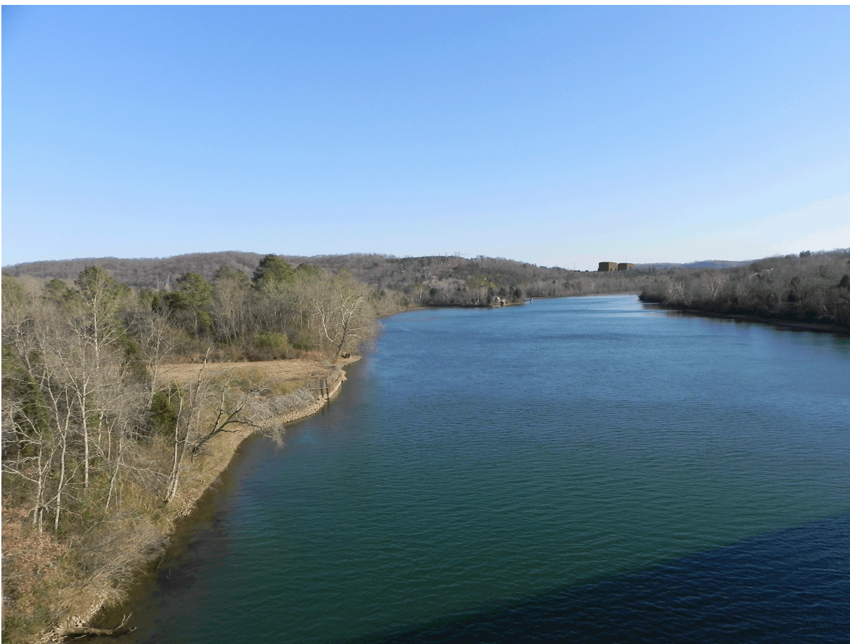
Figure 5.8-27. View from KOP 40 with the CR SMR Project