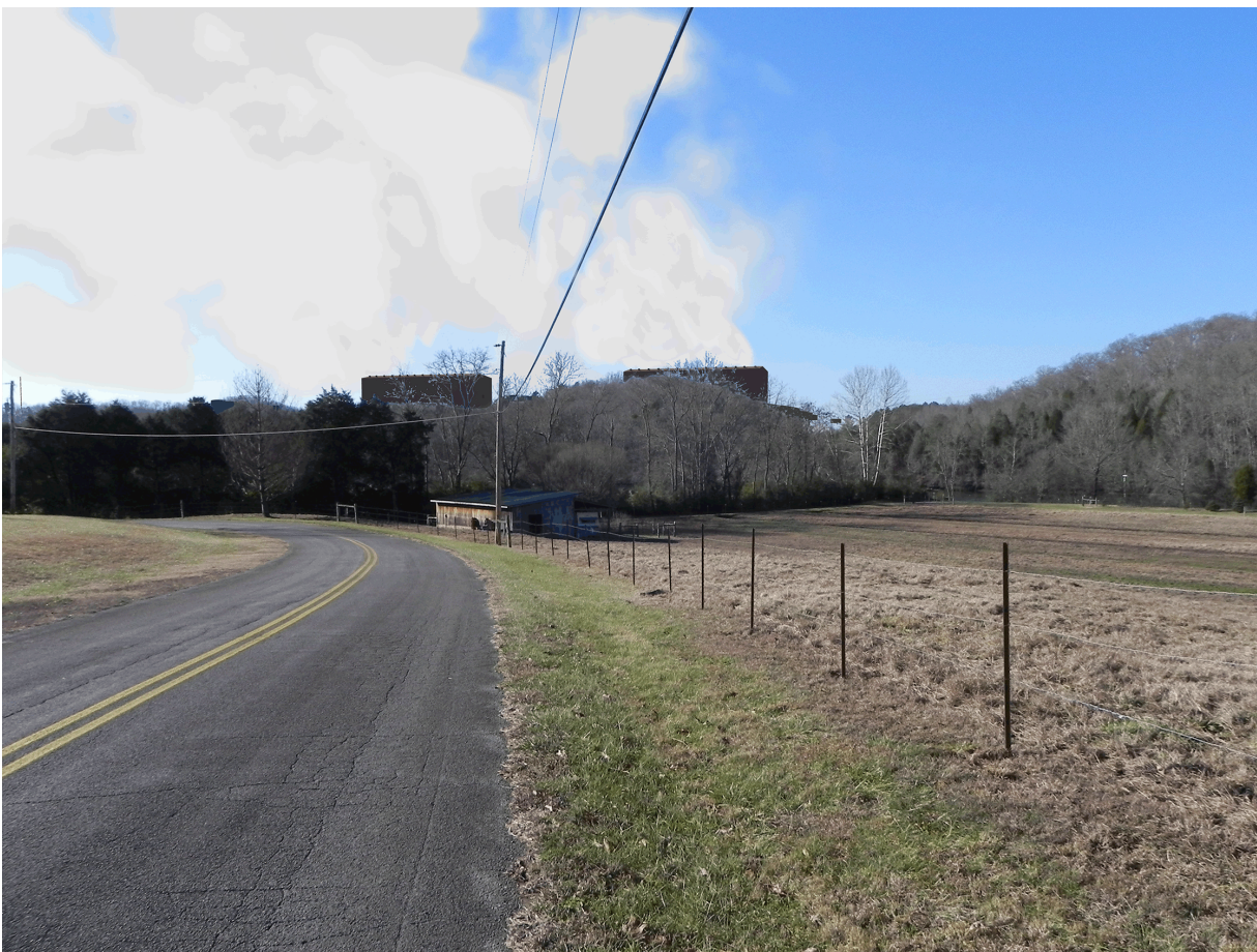
Figure 5.8-5. View from KOP 5 with the CR SMR Project and the Winter Plume