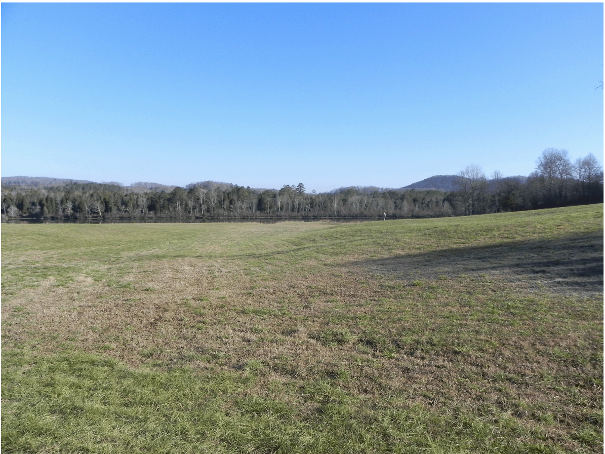
Figure 5.8-14. Baseline View from KOP 16