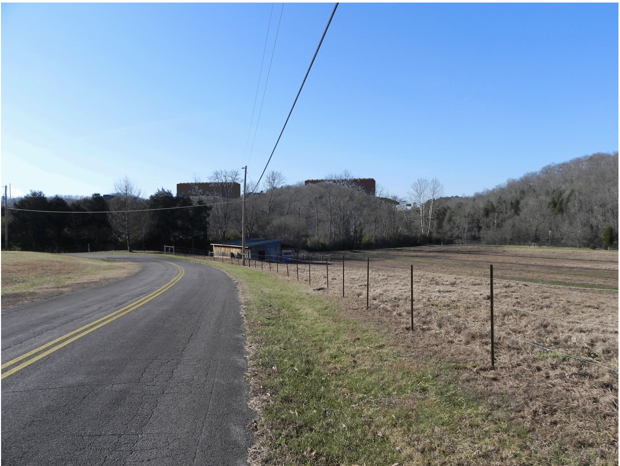
Figure 5.8-3. View from KOP 5 with the CR SMR Project