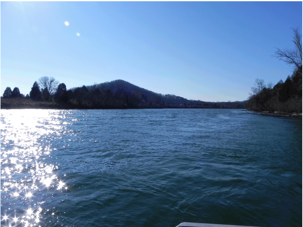
Figure 5.8-22. Baseline View from KOP 22