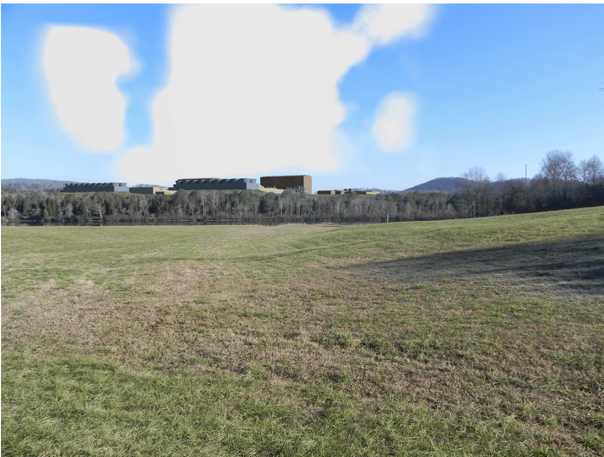
Figure 5.8-16. View from KOP 16 with the CR SMR Project and the Average Annual Plume