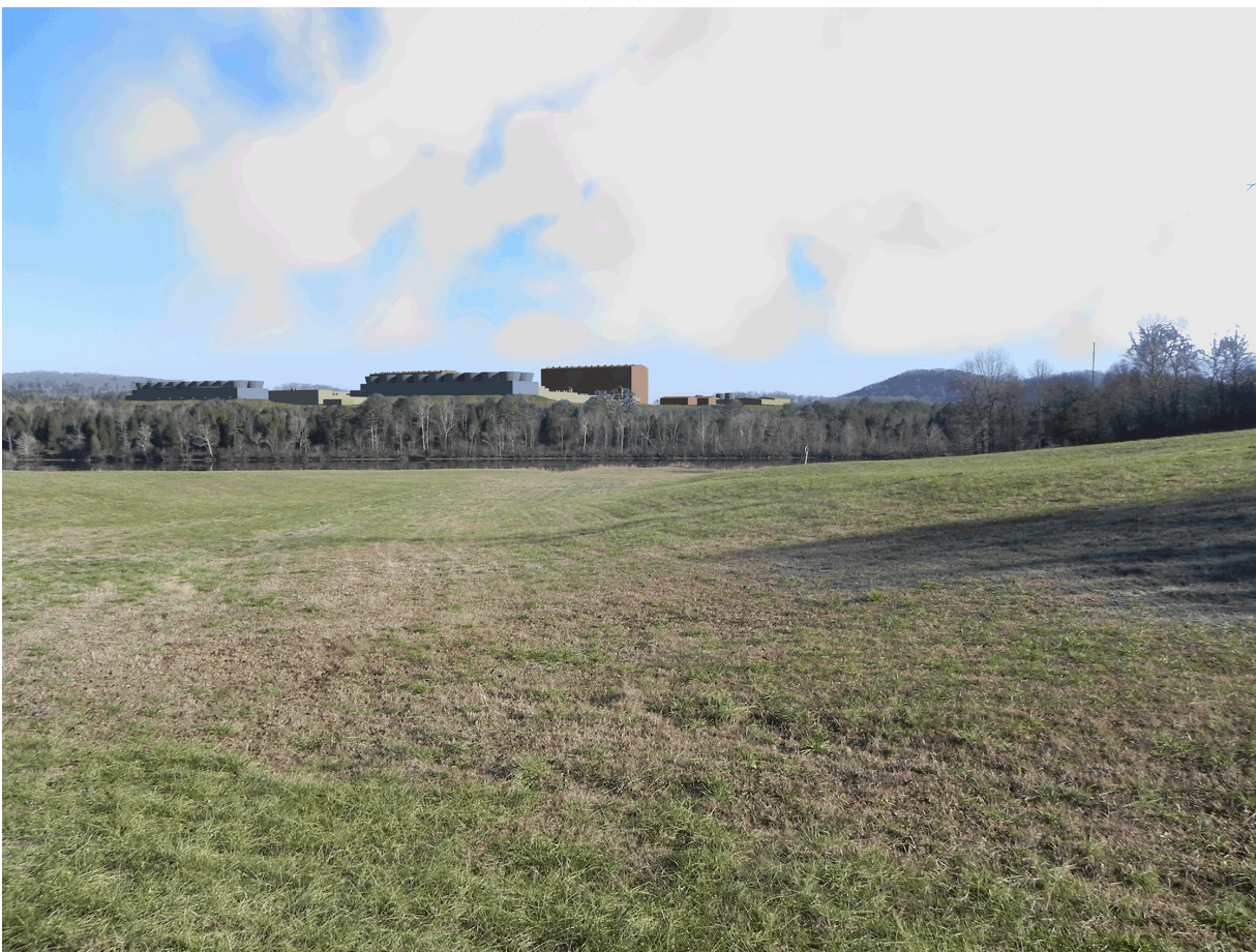
Figure 5.8-17. View from KOP 16 with the CR SMR Project and the Winter Plume