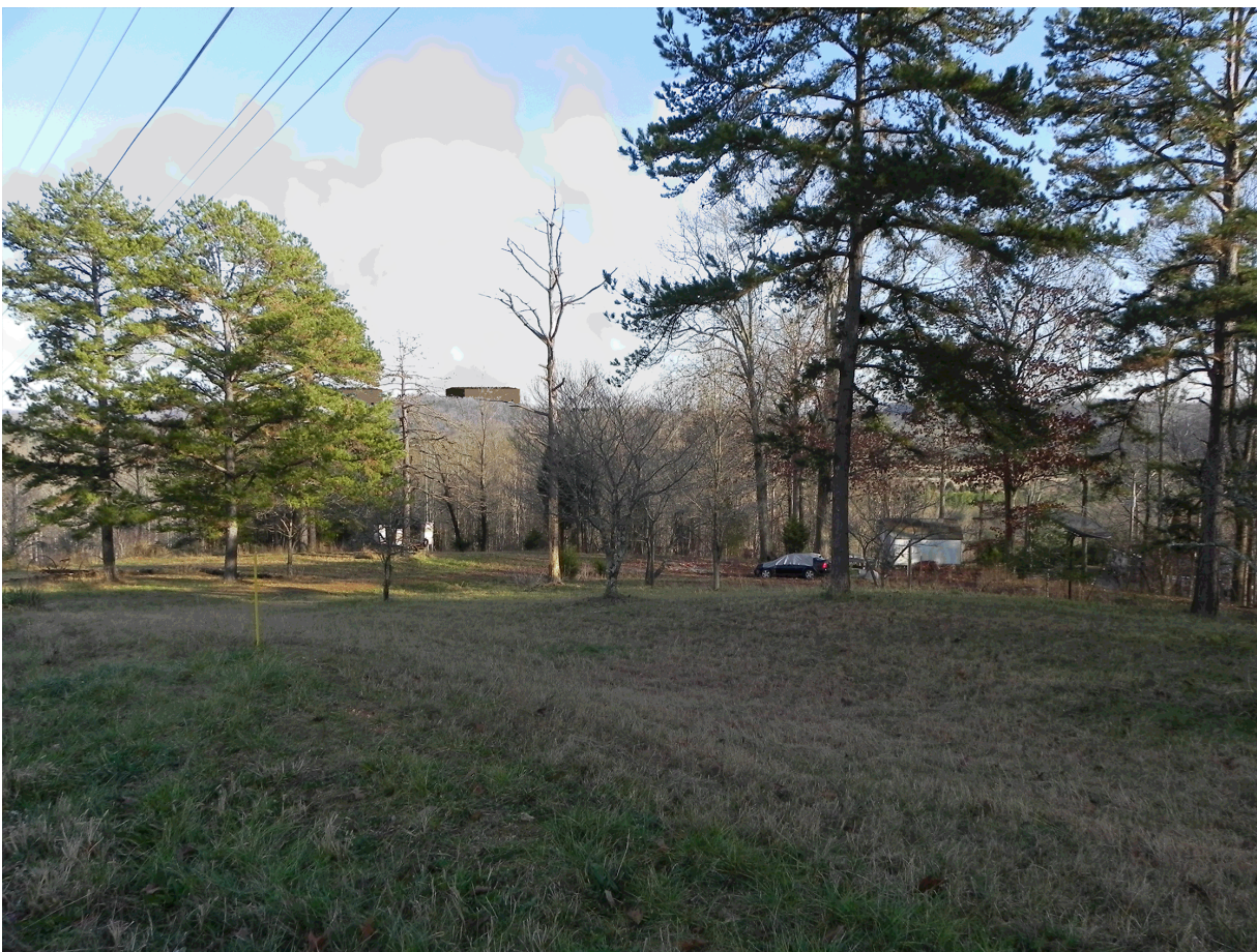
Figure 5.8-9. View from KOP 7 with the CR SMR Project and the Winter Plume