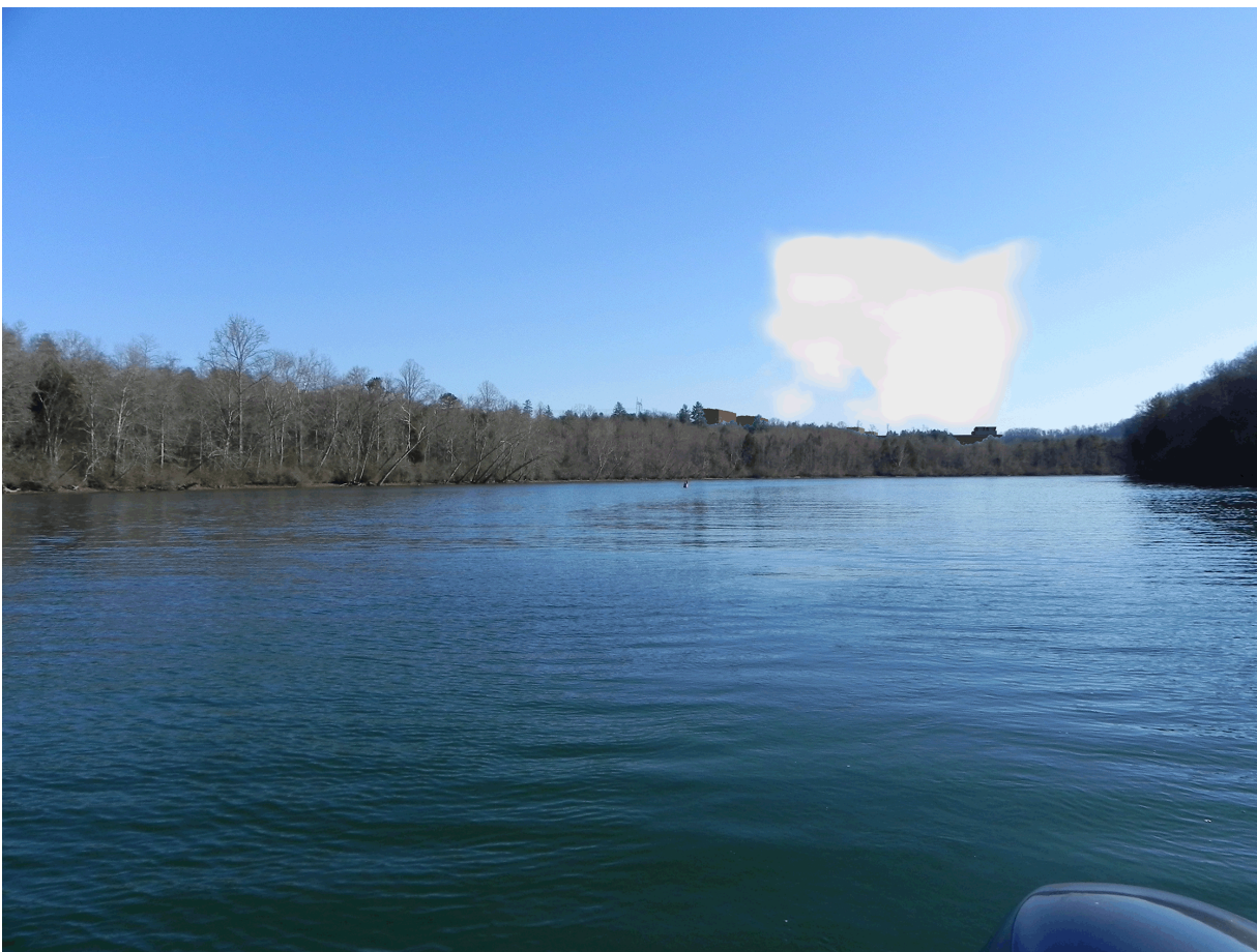
Figure 5.8-20. View from KOP 19 with the CR SMR Project and the Average Annual Plume