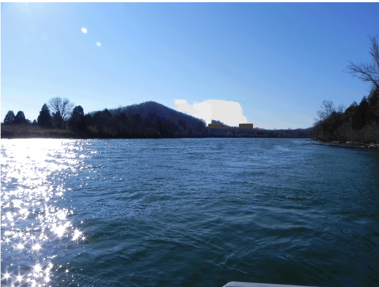
Figure 5.8-24. View from KOP 22 with the CR SMR Project and the Average Annual Plume