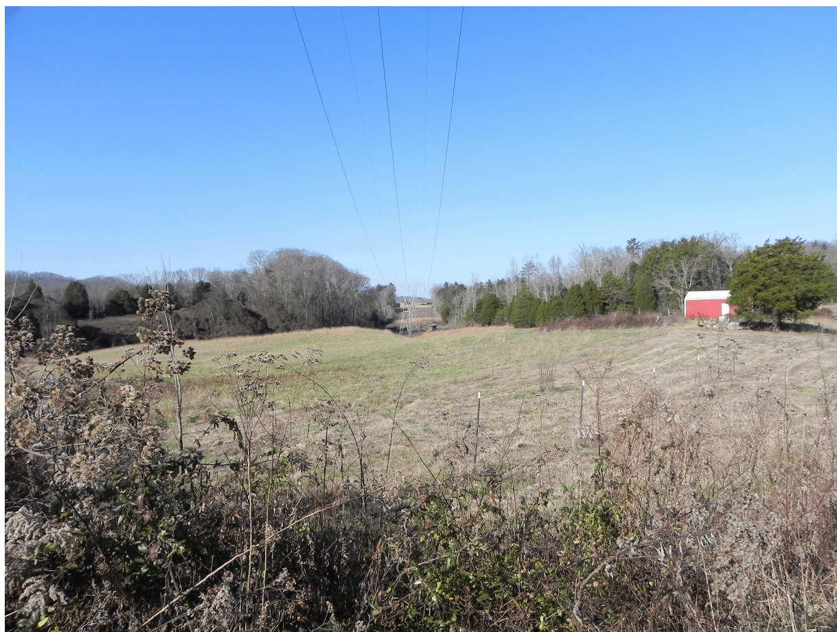
Figure 5.8-11. View from KOP 8 with the CR SMR Project