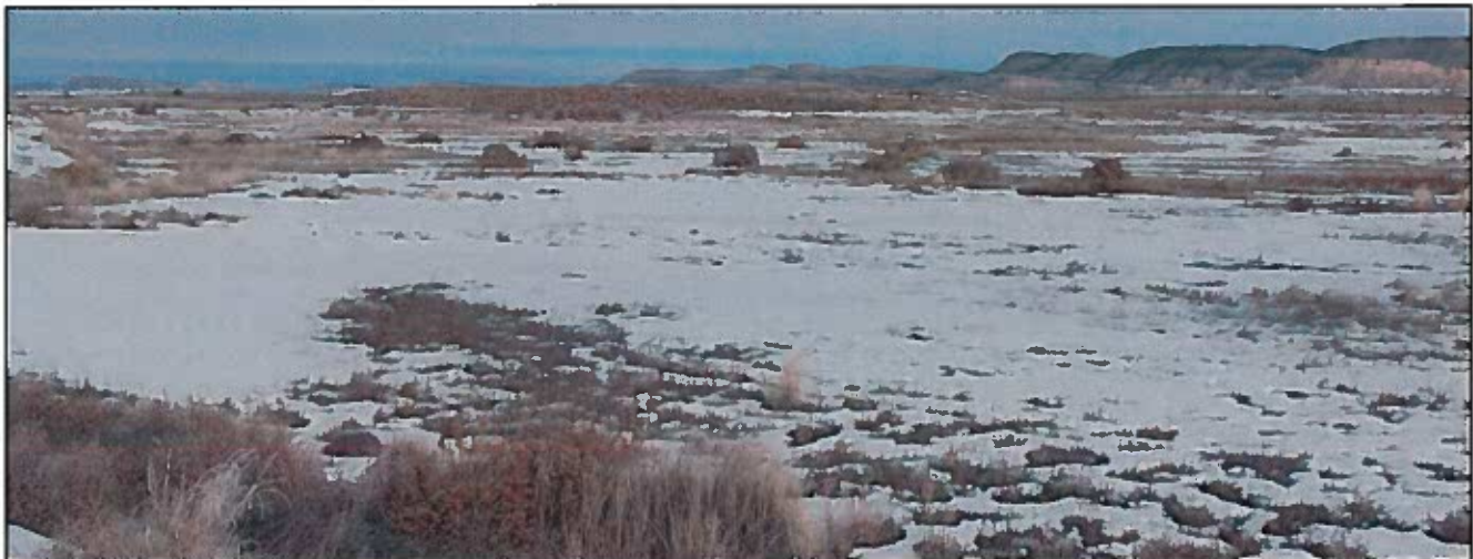
Figure 1. Section 4 Ponds looking north from the southwest corner along Highway 509

Department staff conducted a site visit on 10 January 2019. Because the Section 4 Ponds are located on private property, only the southwestern portion of the area could be observed from along the fence line on Highway 509. Plants observed included perennial grasses, kochia ( Kochia scoparia ), rubber rabbitbrush ( Ericameria nauseosa ), four-wing saltbush ( Atriplex canescens ), and tamarisk ( Tamarix sp. ). Overall shrub density was low, with areas of grass cover being highly dispersed and relatively small in size. Areas including bare ground with little to no vegetation exposed through the short snow cover encompassed as much as 50 percent of the total area (Figure 1).