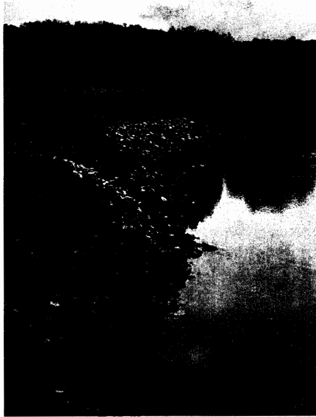
Fig. 1: Canonsburg site –Riprap stabilization between site boundary fence and Chartiers Creek (looking northwest).