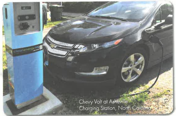
Chevy Volt at Asheville Charging Station, North Carolina

The Southern Alliance for Clean Energy (SACE) promotes responsible energy choices that work to address the impacts of global climate change and ensure clean, safe and healthy communities throughout the Southeast.