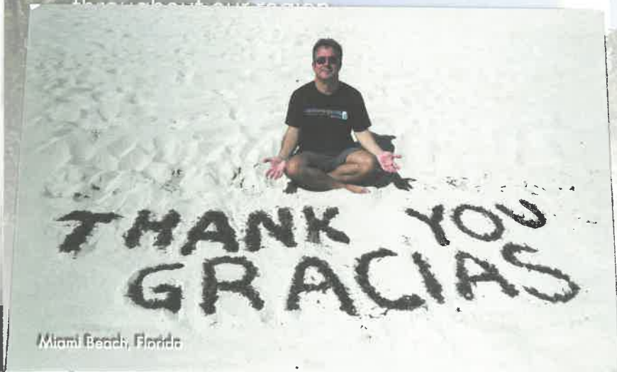
Miami Beach, Florida

By embracing energy efficiency and clean renewable energy, utilities can permanently retire old, dirty, inefficient coal-fired power plants without jeopardizing reliability. This will help reduce air and water pollution, and improve public health in communities throughout our region.