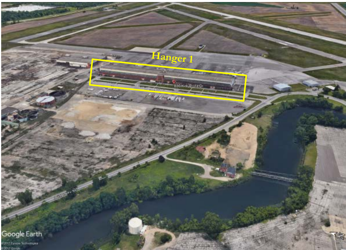
Figure 3. Aerial View of Hanger 1 in 2017 (Google Earth Pro 2017)

The Township of Ypsilanti is located in Washtenaw County. According to the 2010 U.S. Census, the population of Ypsilanti charter township was 53,362; the 2016 population estimate for the township was 54,875 (United States Census Bureau 2017). The size and location of the office space previously occupied by Sundog within Hanger 1 is unknown. However, as of 2003, Sundog was one of twenty tenants occupying Hanger 1 (Reynolds, Smith and Hills Inc. 2017). Figure 3 shows the location of the facility within the local community.