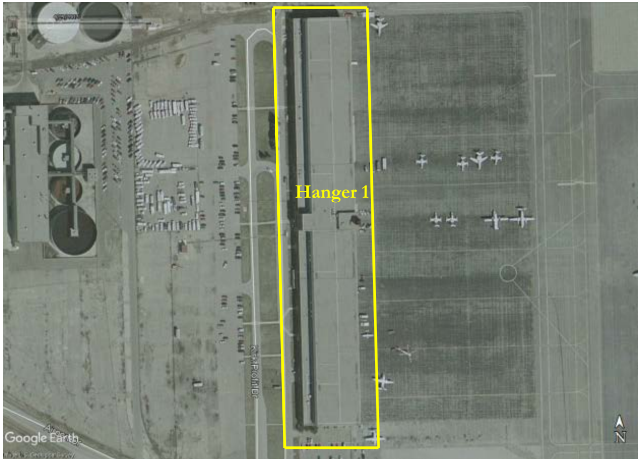
Figure 2. Aerial View of Hanger 1 in 2002 (Google Earth Pro 2017)