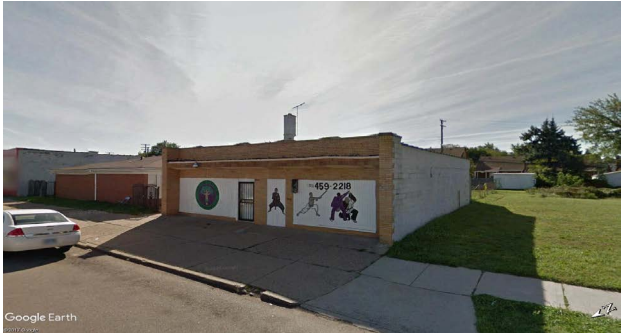
Figure 1. 2013 Street View of 11496 Portlance Avenue, Detroit, Michigan from September 2013 (Google Earth Pro 2017)