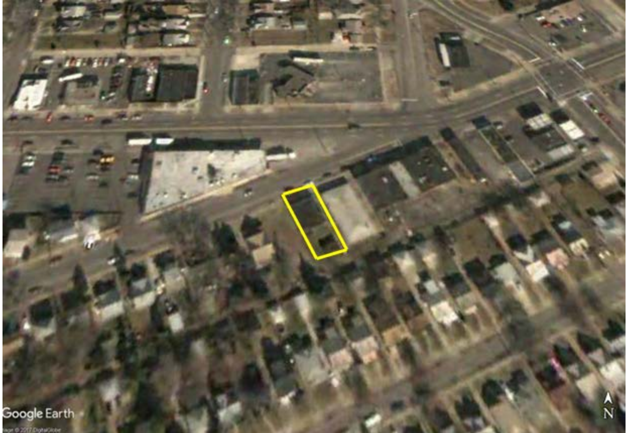
Figure 3. Aerial View of the Portlance Avenue Property in Detroit, Michigan Site from March 2002 (Google Earth Pro 2017)