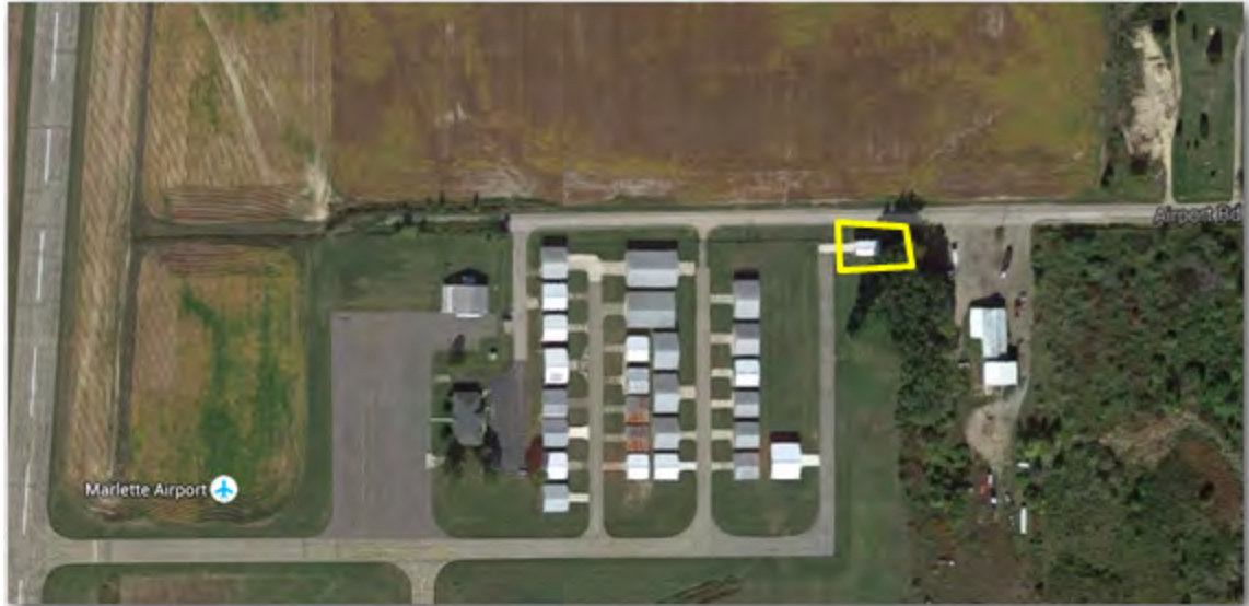
Figure 1. Location of Burton Aviation (6727 Airport Road, Marlette, MI)