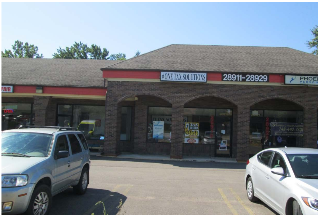
Figure 1. 28919 West Seven Mile Road

The tenant occupies approximately 78 square meters of the building at 28919. The interior walls are drywall, and the floors are either carpet or tile/laminate. The north side is a waiting area with chairs and a small office. The south side is an office area with two desks, a bathroom, and small break area, and the middle area has a closet and couch. According to the owner, the tenant is present three to four months a year.