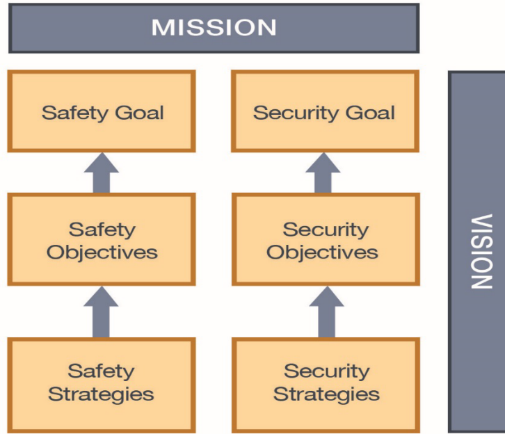
Figure 1 Graphical depiction of strategic plan components

Appendix A covers key external factors that could affect the agency’s ability to effectively execute this plan.