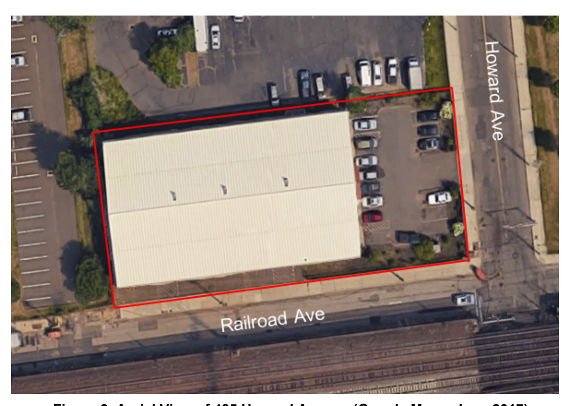
Figure 3. Aerial View of 485 Howard Avenue