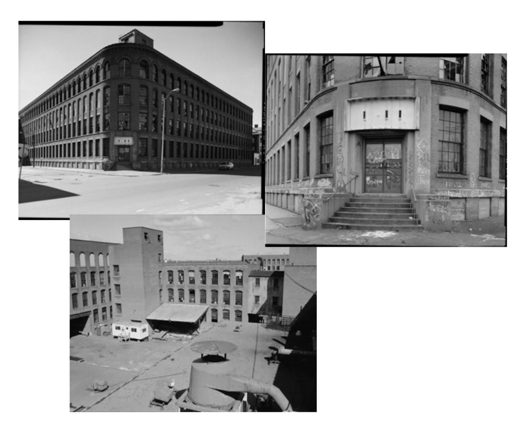
Figure 1. Photos of Former Bryant Electric Company Structures Prior to Demolition in 1996 (ORNL 2015)

Prior to commencing survey activities, the land area was examined for consistency with historical information and to identify impediments to conducting the survey and/or health and safety considerations. No health or safety concerns were identified. The inspection team had full access to the land areas surrounding the building except for areas immediately north and west of the building, which were inaccessible due to tall weeds and storage of items.