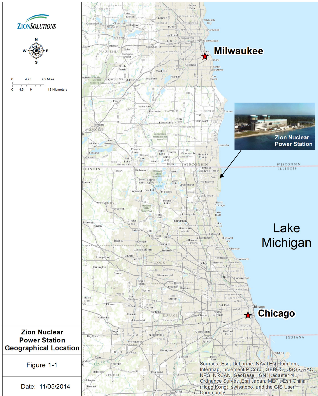
Figure 1-1 Zion Nuclear Power Station Geographical Location