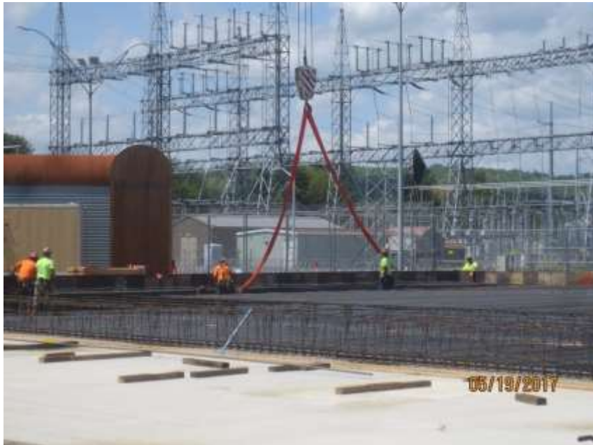
Rebar Placement for 2 nd ISFSI Pad