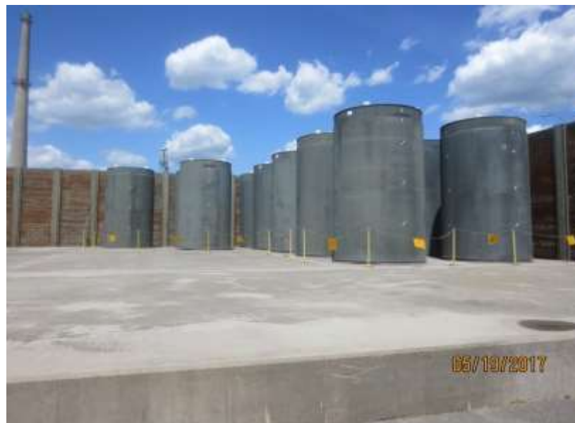
Current ISFSI Pad Configuration