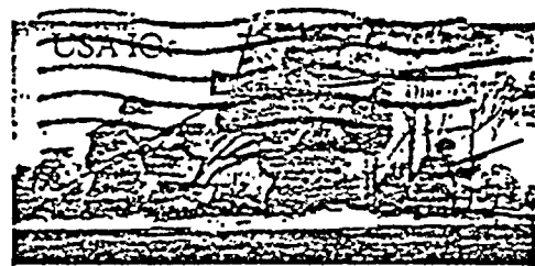
George Rogers Clark, Vincennes, 1779