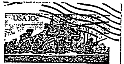
George Rogers Clark, Vincennes, 1779