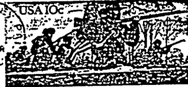
George Rogers Clark, Vincennes, 1779