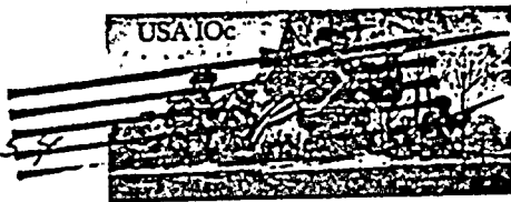
George Rogers Clark, Vincennes, 1779