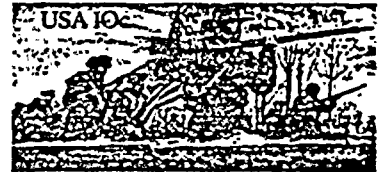
George Rogers Clark, Vincennes, 1779