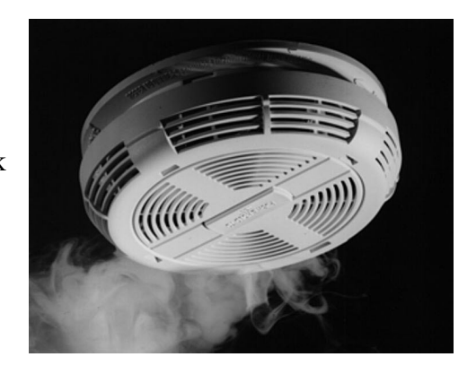
Ionization chamber smoke detector

Smoke detectors have saved thousands of lives since they came into use in the 1960s. Ionization chamber smoke detectors, the most common type, use radiation to detect smoke. The NRC allows this "beneficial use" of radioactive material because a smoke detector's ability to save lives far outweighs any health risk from the radiation. These products use very small amounts of radioactive materials. They are so safe homeowners can use them without an NRC license. Manufacturers and distributors do need an NRC license. To receive one, they must show their products meet the NRC's health and safety requirements and are properly labeled.