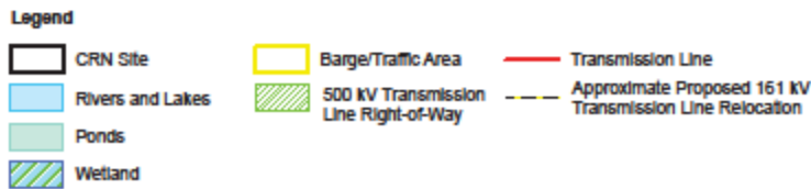
Figure 2.1-3. CRN Site Layout