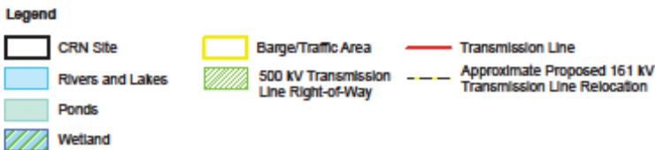
Figure 2.1-3. CRN Site Layout