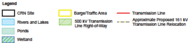
Figure 2.1-3. CRN Site Layout