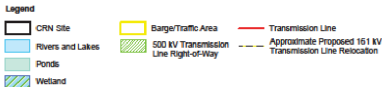
Figure 2.1-3. CRN Site Layout