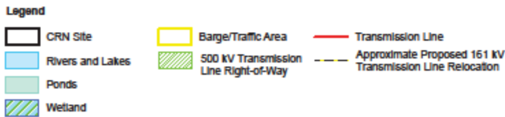
Figure 2.1-3. CRN Site Layout