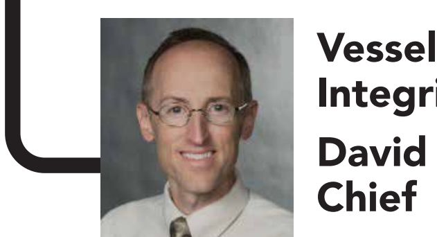
Vessels and Internals