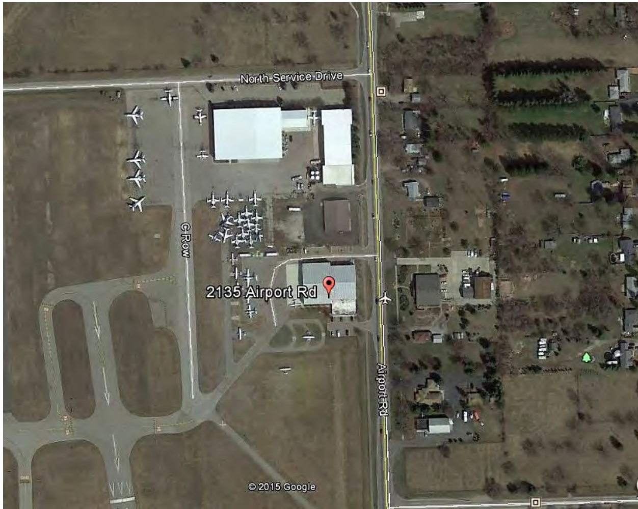
Figure 3. Approximate Location of Metro Aircraft Instruments (2135 Airport Road, Waterford, MI) (Google, Earth 2015)