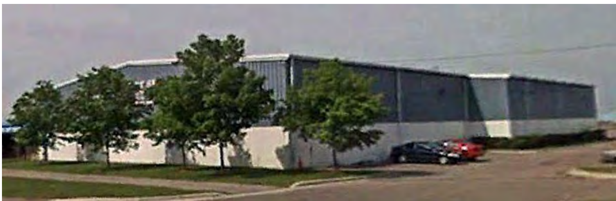
Figure 2. Approximate location of Metro Aircraft Instruments