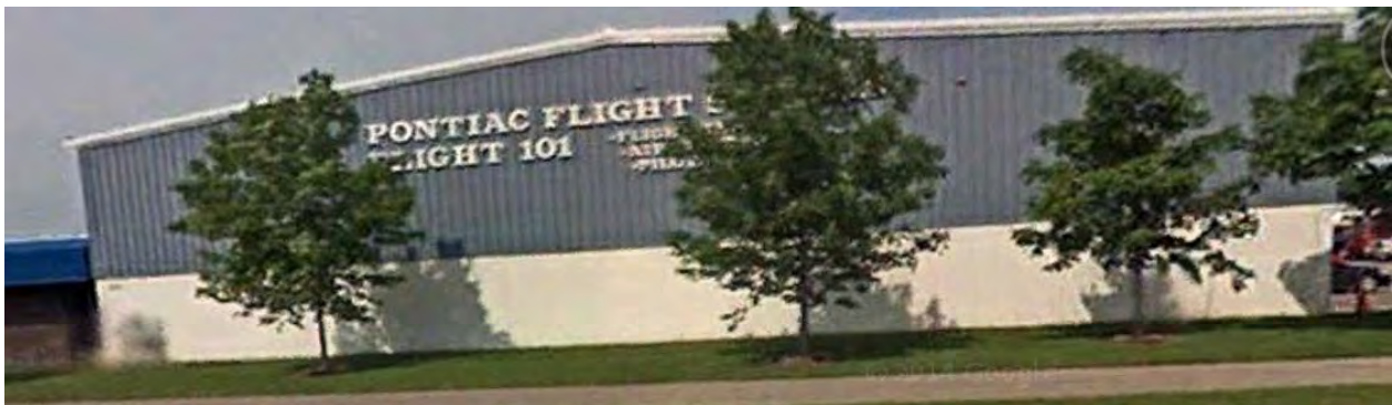
Figure 1. Approximate location of Metro Aircraft Instruments

Due to historic documentation of luminous radium usage in vintage aircraft gauges, it is suspected that radium was present in some of the aircraft instruments repaired at this facility.