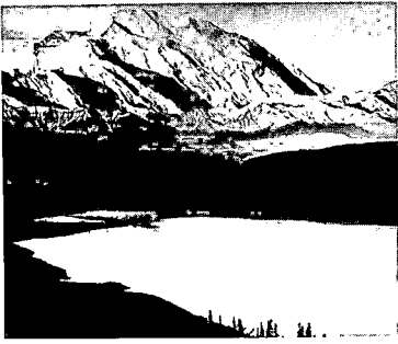
Sunrise, Mt. McKinley