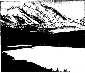
Sunrise, Mt. McKinley