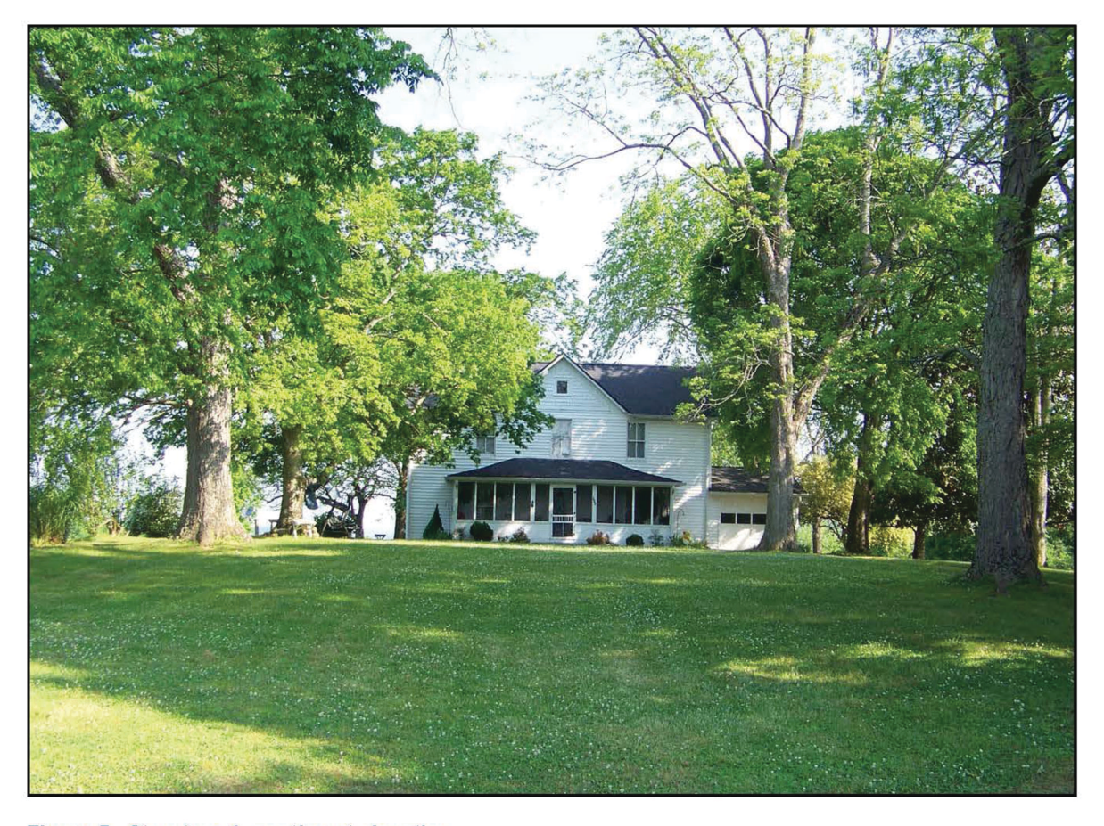
Figure 5. Structure 1, southeast elevation.