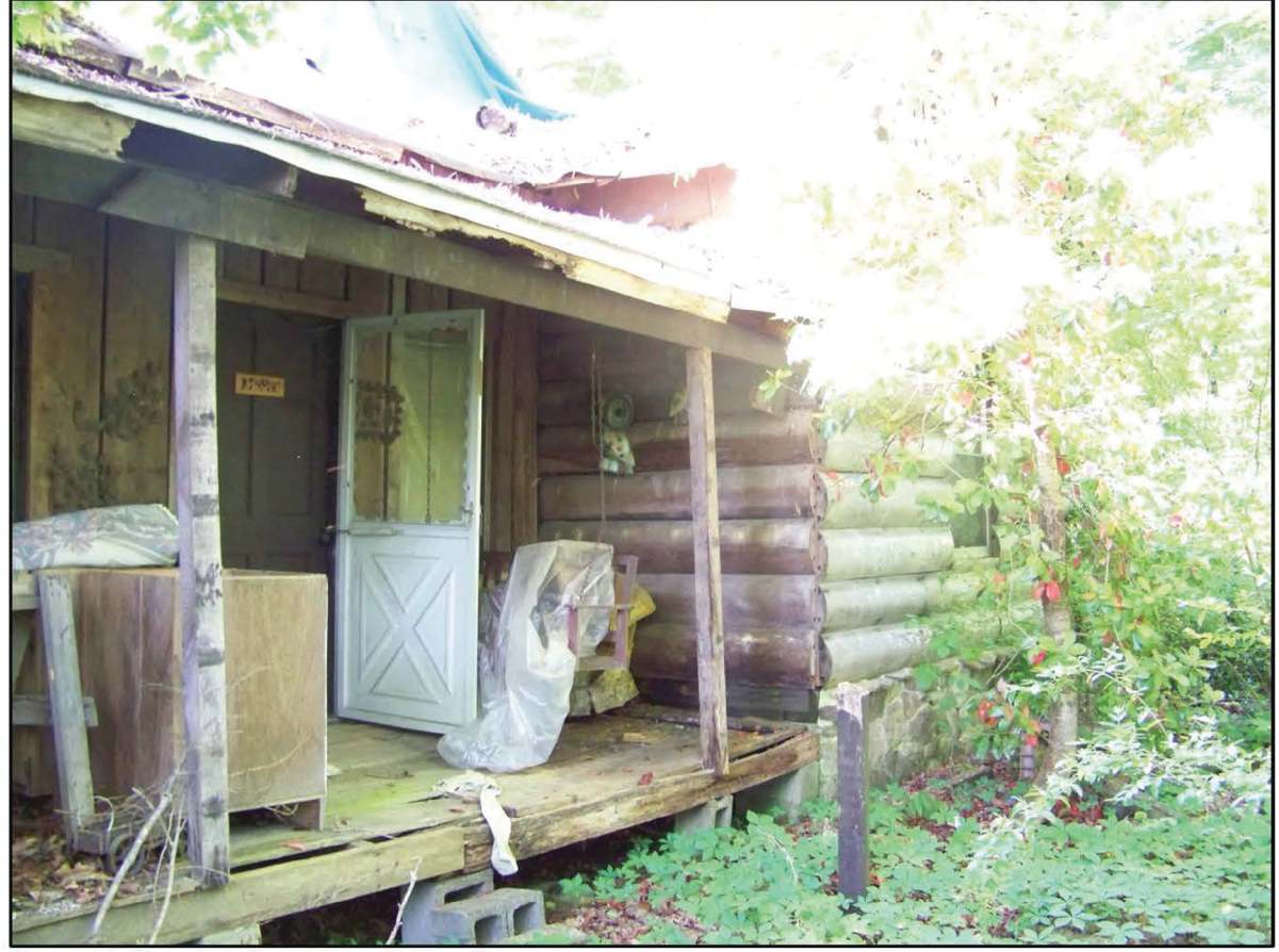
Figure 7. Structure 3, northwest elevation.