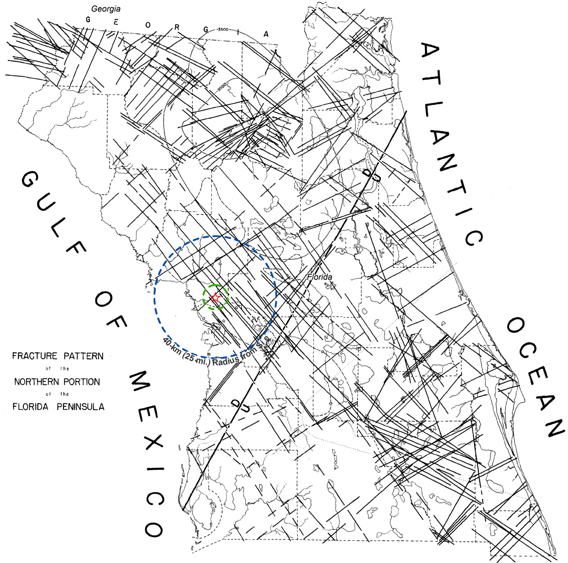
FRACTURE PATTERN of the NORTHERN PORTION of the FLORIDA PENINSULA