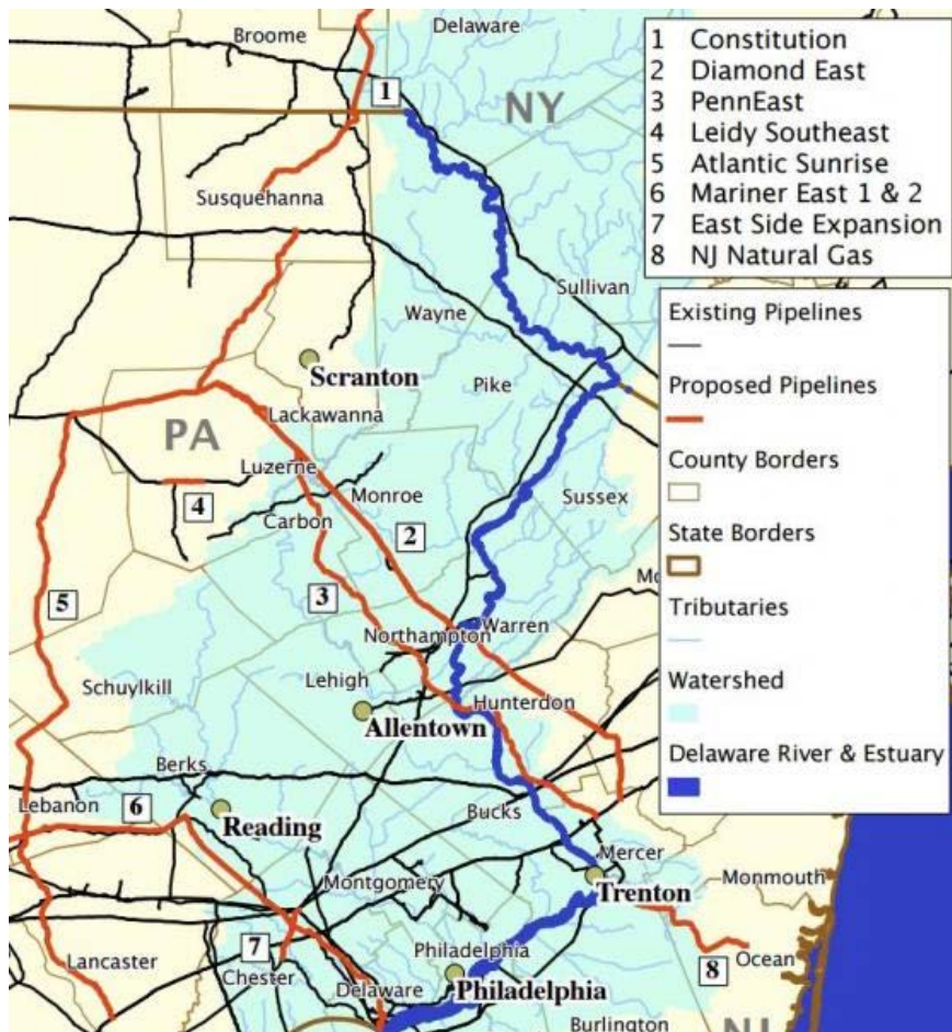
Proposed pipelines in the Delaware River Watershed. February, 2015 (Sam Koplinka-Loehr, Clean Air Council) Map available for download at bottom of page.