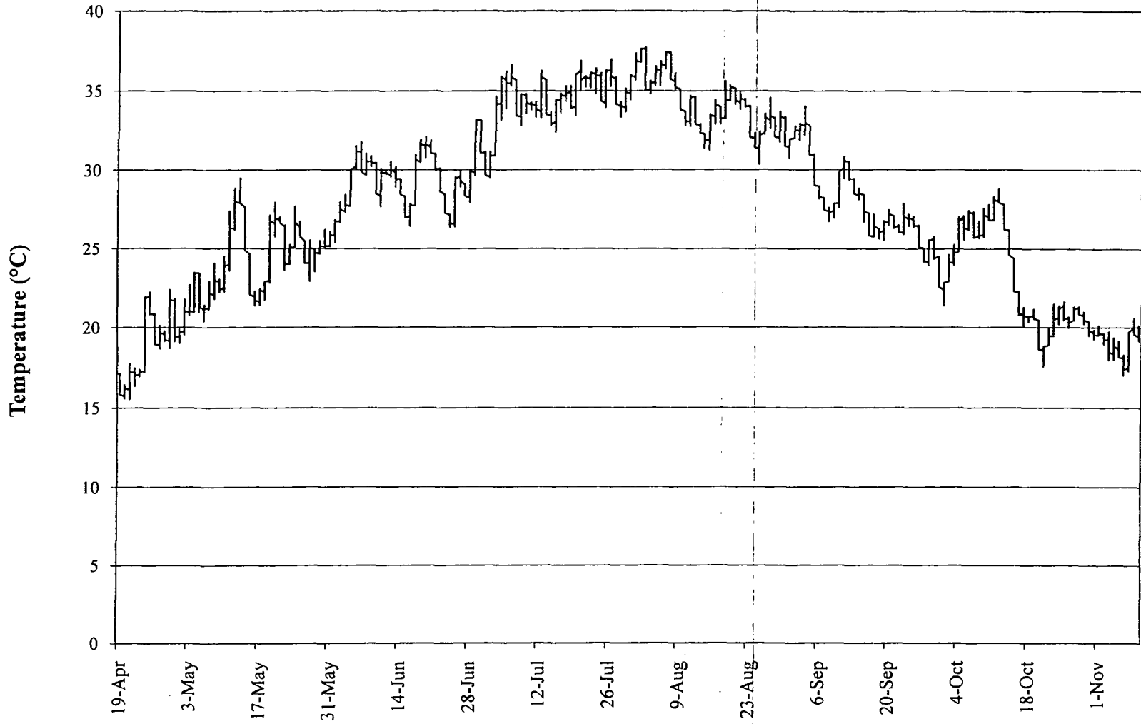
Figure 3-2. Temperature Profile at LaSalle Lake for the Period of 19 April to 9 November, 2011.