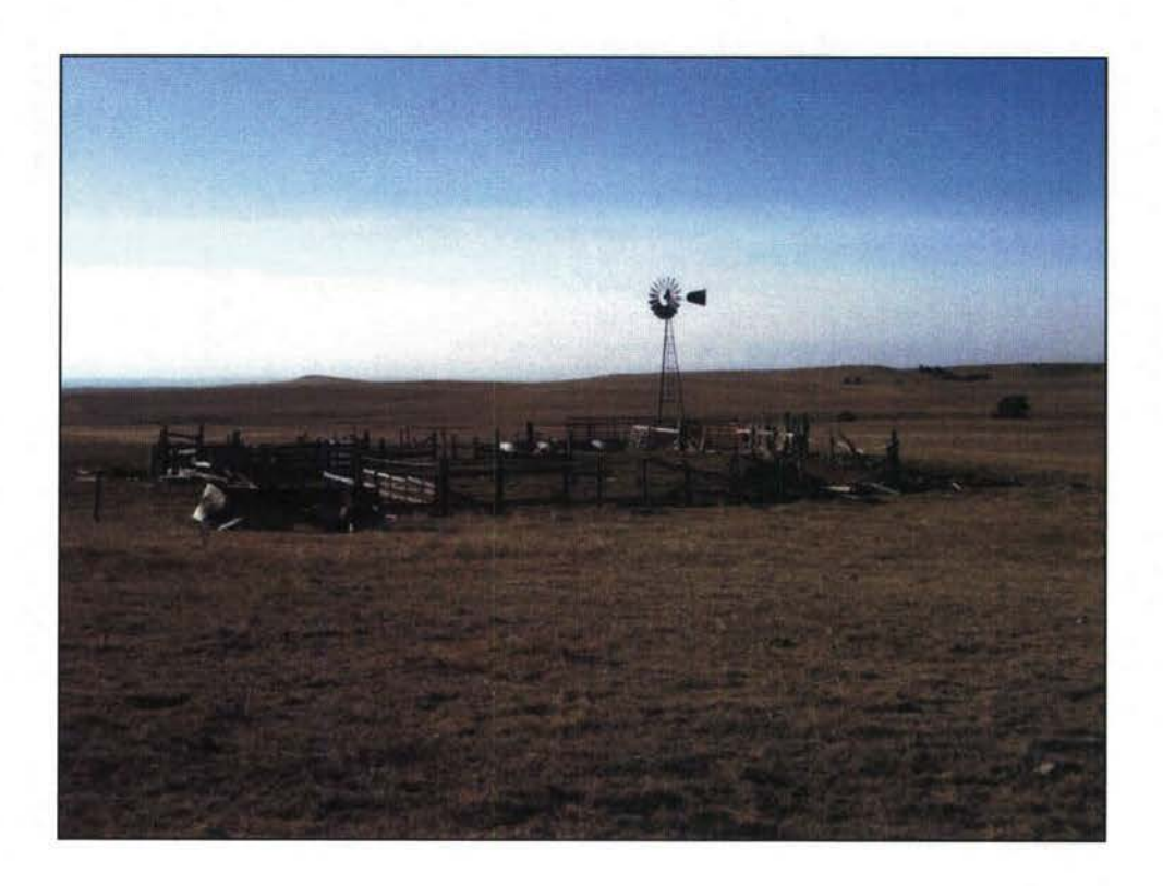
Figure 99. 25DW367, overview of corral (Feature F1) and windmill (Feature F2), facing southwest. Photograph taken by Ashley Howder, on 12/05/2010.