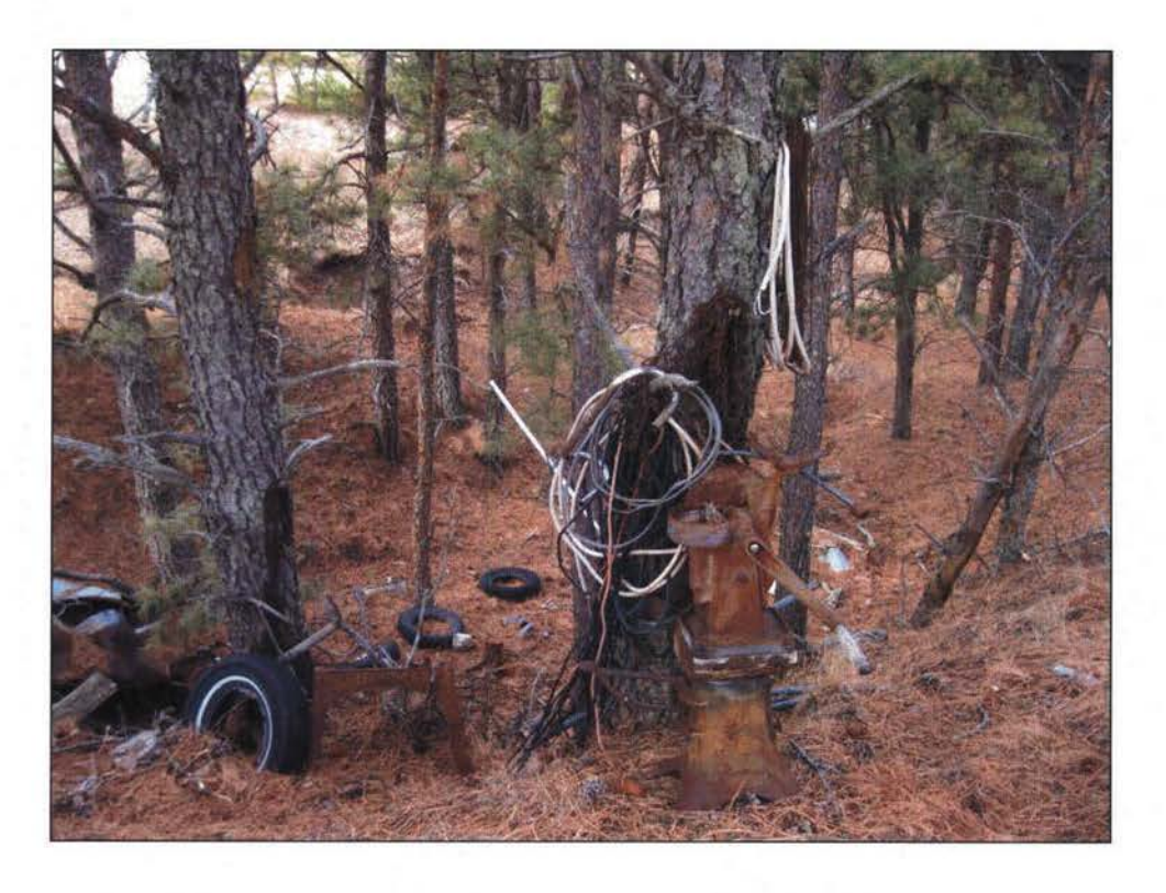
Figure 95. 25DW366, Feature F5 debris dump, facing northwest. Photograph taken by Natalie Graves 12/3/10.