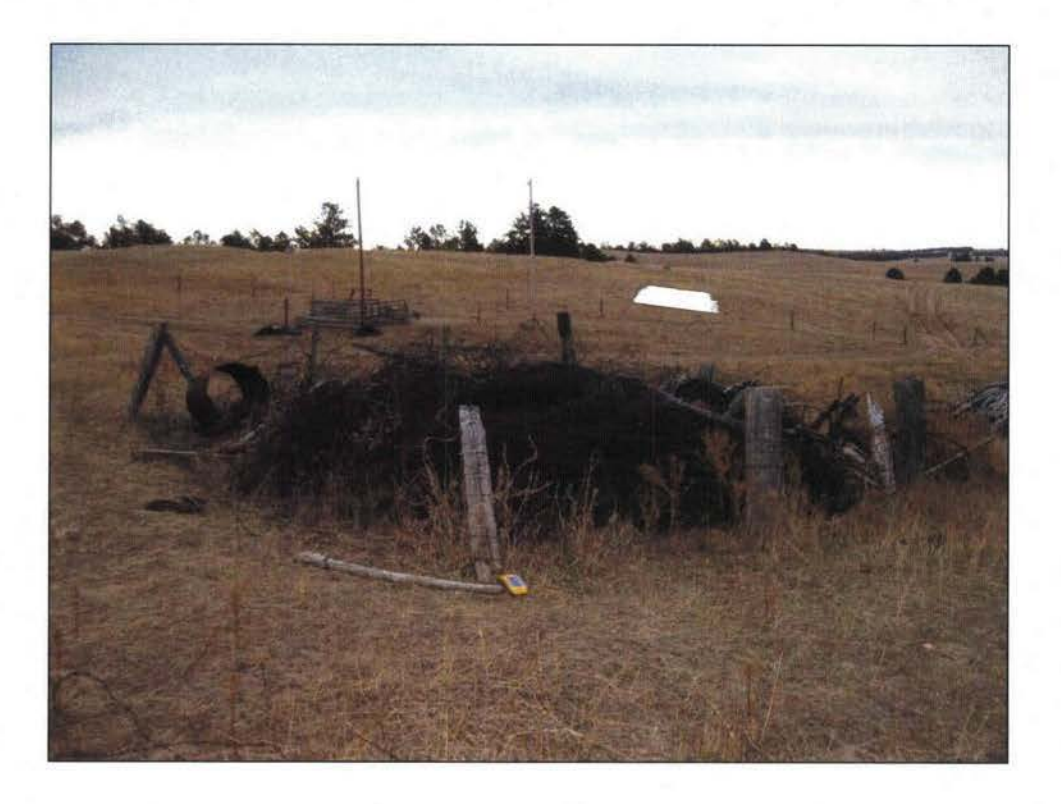
Figure 97. 25DW366, enclosed debris, facing northeast. Photograph taken by Russ Collett 12/3/10.