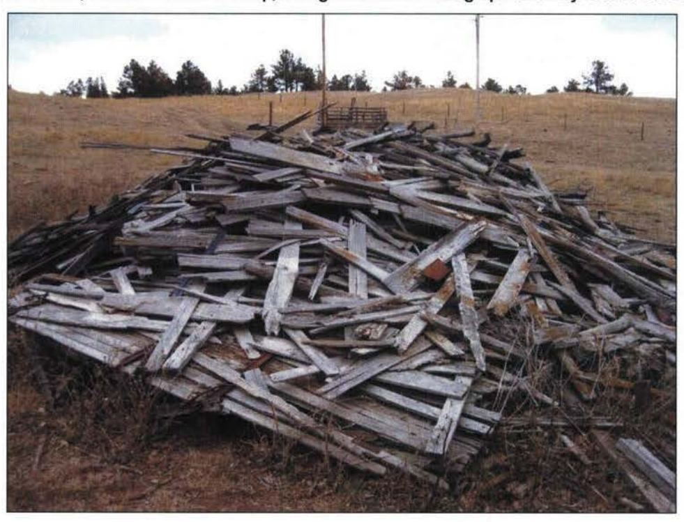
Figure 96. 25DW366, Pile of wood from a razed structure, facing north. 12/3/10.