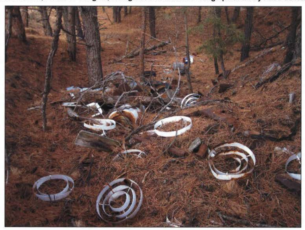
Figure 94. 25DW366, Feature F5 debris dump, facing north-northeast. Photograph taken by Natalie Graves 12/3/10.