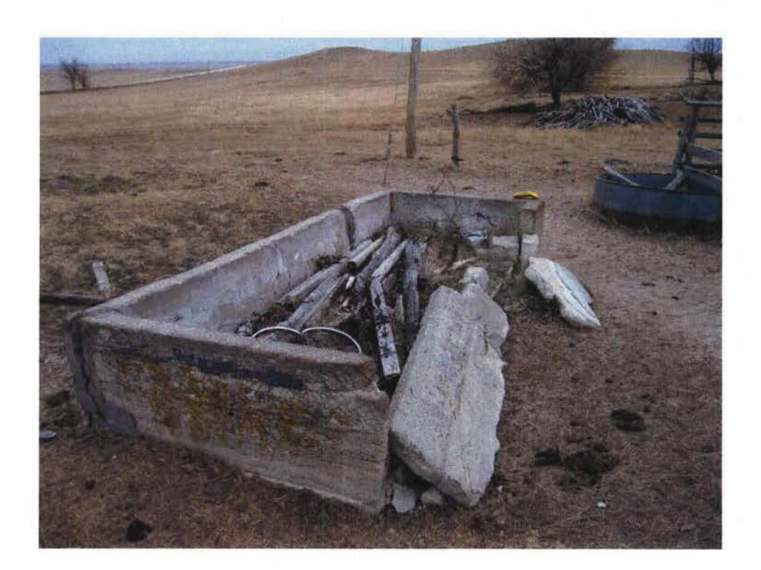
Figure 91. 25DW366, Feature F2 concrete trough with Trimble GPS unit at datum, facing southeast. Photo by Russ Collett 12/3/10.

United States Nuclear Regulatory Commission Official Hearing Exhibit In the Matter of: CROW BUTTE RESOURCES, INC. (License Renewal for the In Situ Leach Facility, Crawford, Nebraska) ASLBP #: 08-867-02-0LA-BD01 Docket #: 04008943 Identified: 8/18/2015 Admitted: 8/18/2015 Rejected: Stricken: Other: