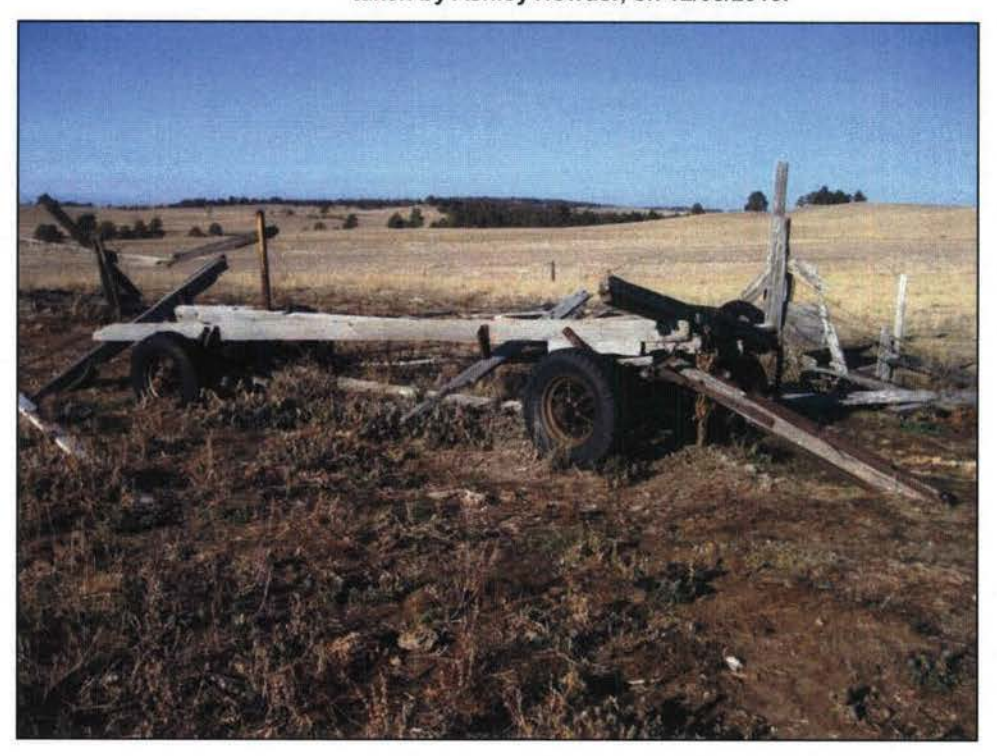
Figure 100. 25DW367 wagon, facing northwest. Photograph taken by Ashley Howder, on 12/05/2010.