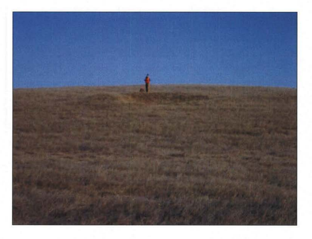
Figure 102. 25DW368, historic dugout (Feature F1), facing north. Photograph taken by Ashley Howder on 12/6/10.