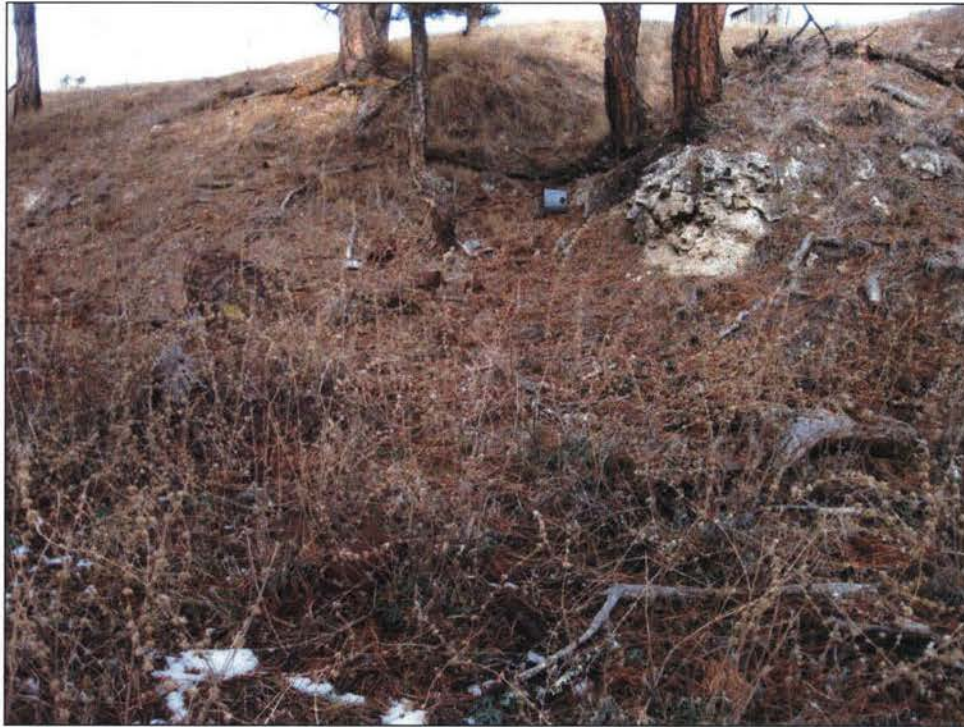
Figure 82. 25DW365, small debris dump (Feature F6), facing northeast. Photograph taken by Ashley Howder, on 12/03/2010.