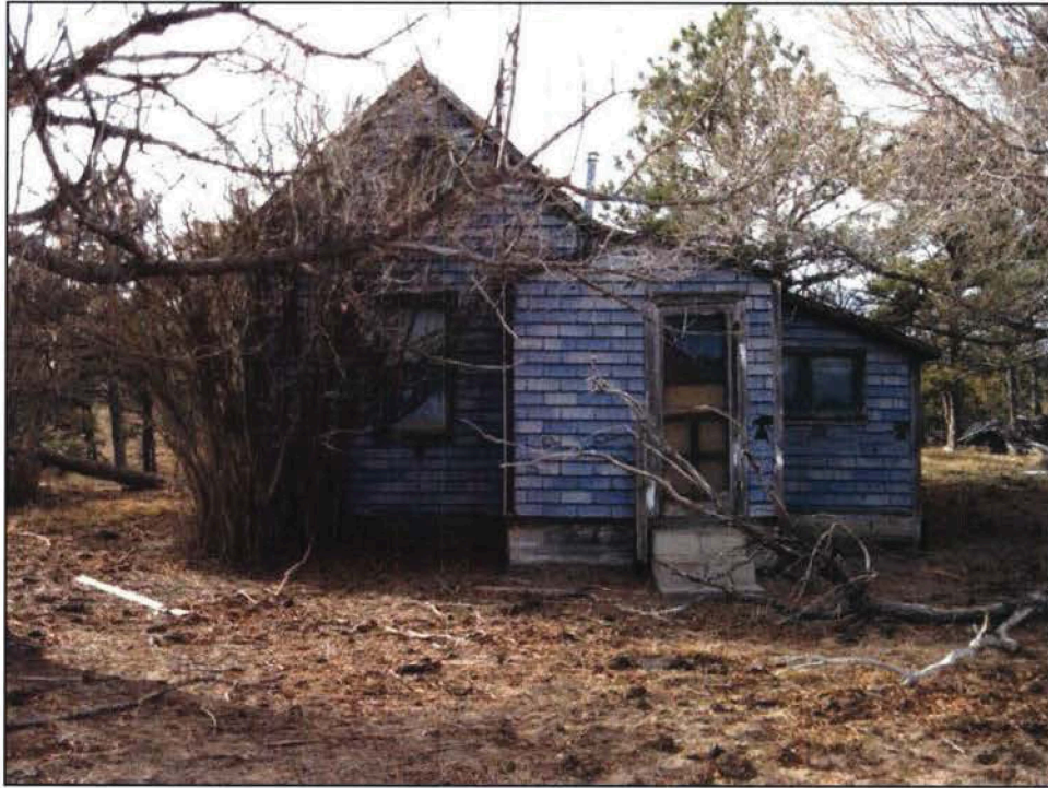
Figure 77. 25DW365, Farm House (Feature F1), facing west. Photograph taken by Ashley Howder, on 12/03/2010.

25DW365 lack a unique design and any other unusual physical characteristic. Therefore, site 25DW365 does not possess enough significance to qualify for the National Register. Site 25DW365 is a common historic site likely associated with historic and early modern ranching or farming activities in the region that ARCADIS recommends not eligible for listing on the NRHP and no further work is necessary.