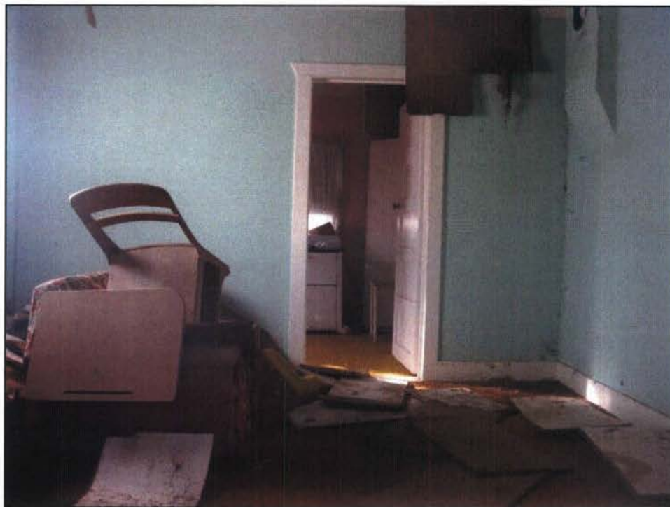
Figure 78. 25DW365, interior of Farm House (Feature F1) showing southeastern room. Photograph taken by Ashley Howder, on 12/03/2010.