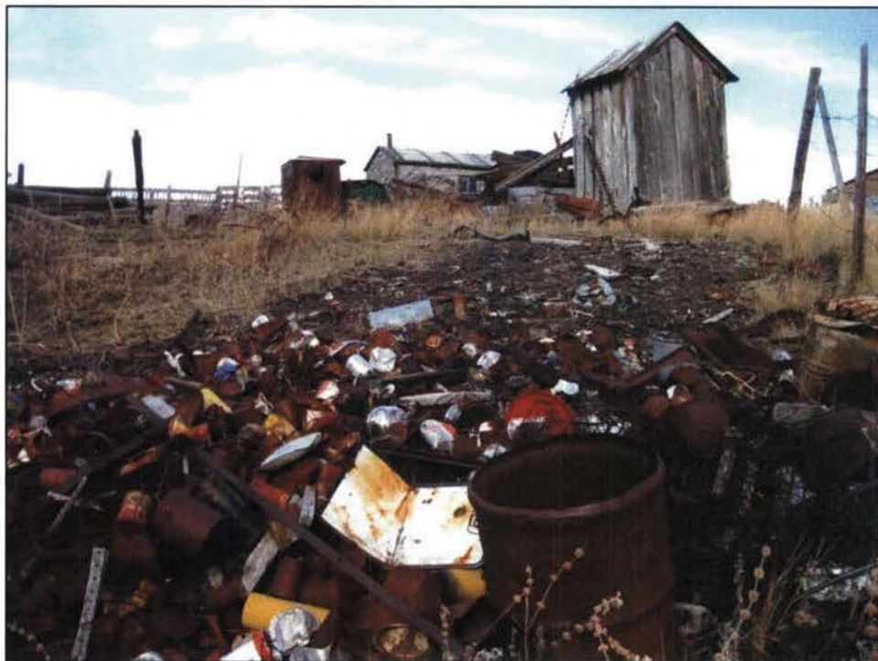
Figure 81. 25DW365, main debris dump (Feature F5) with small oil/storage shed (Feature F8) and laundry shed (Feature F7) in background, facing east. Photograph taken by Ashley Howder, on 12/03/2010.