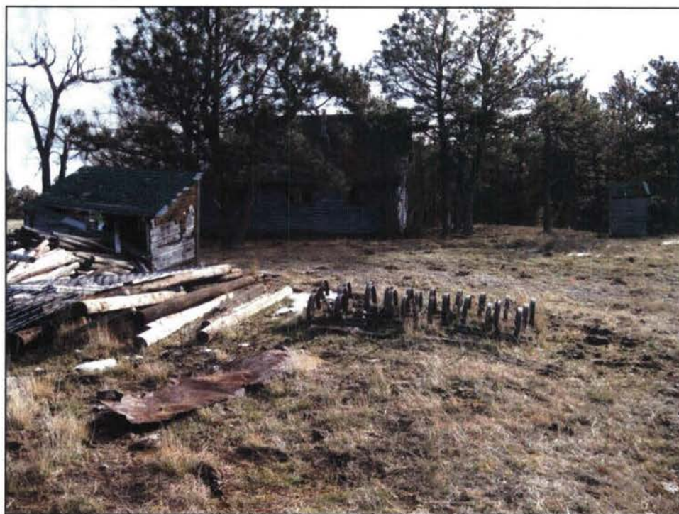
Figure 79. 25DW365, shown from left to right: oil shed (Feature F4), north face of main farm house (Feature F1), and outhouse (Feature F2), facing south. Photograph taken by Ashley Howder, on 12/03/2010.