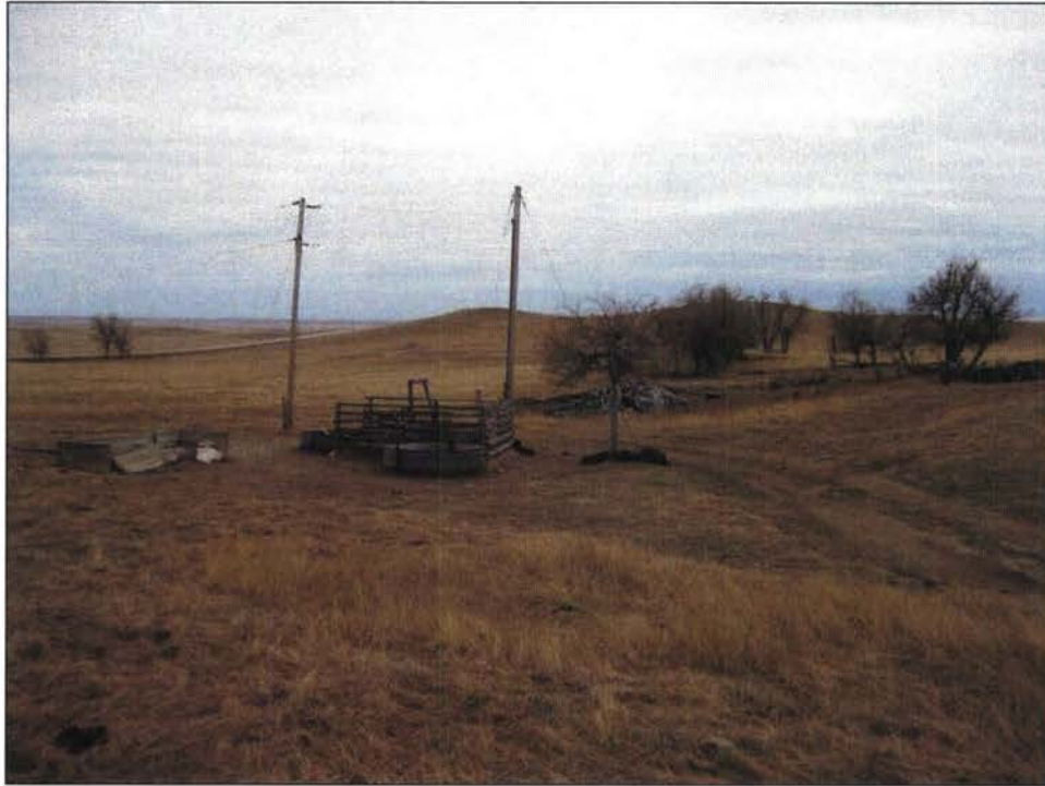
Figure 89. 25DW366, site overview, facing southeast. Photograph taken by Russ Collett 12/3/10.