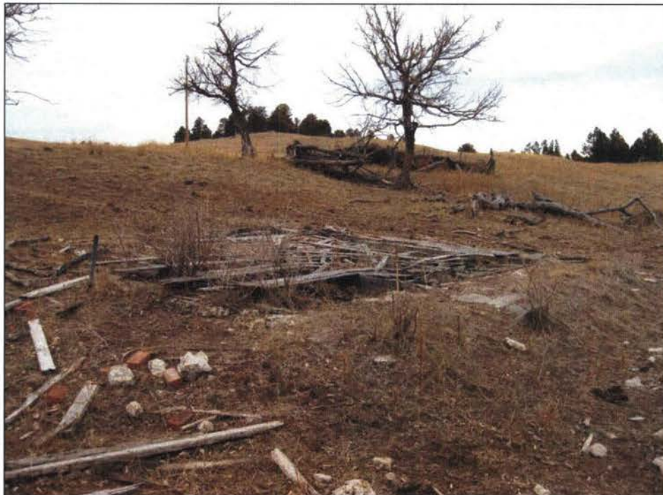
Figure 90. 25DW366, Feature F1 house foundation, facing northwest. Photograph taken by Russ Collett 12/3/10.