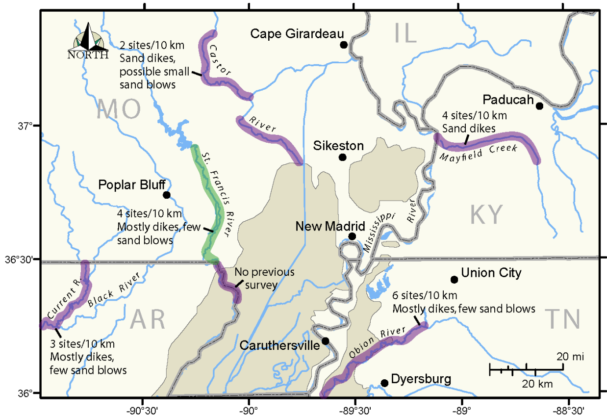
Figure 3 Map of paleoliquefaction study area in Missouri. River segments identified in the NRC's letter of February 15, 2013 are delineated in purple. The NRC has conducted, and may continue, field work in these purple delineated river segments. Additional river segments where the NRC proposes to expand its field work are delineated in green.