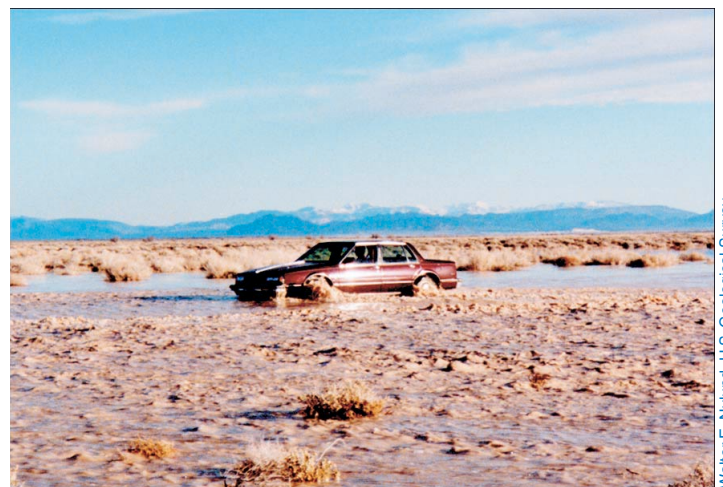
Carson Slough, State Line Road near Death Valley Junction, California, looking north, February 25, 1998.

Precipitation monitoring sites operated by the National Weather Service (NWS), U.S. Fish and Wildlife Service, and National Oceanic Atmospheric Administration (NOAA) recorded 29 to 54 percent of total February precipitation from a regional storm system within 48 hours beginning the morning of February 23, 1998 (Table 1). USGS personnel at NTS reported streamflow in small washes, such as Split and Pagany (which partly drain the eastern slope of Yucca Mountain), during the morning of February 23 (Fig. 1). By mid-afternoon, Yucca, Topopah, and Fortymile Washes also were reported flowing. Fortymile Wash was flowing over roads on NTS near Yucca Mountain (Daniel Soeder, U.S. Geological Survey, written commun., 1998). Peak streamflow estimates for Fortymile and Topopah Washes (Table 2) and downstream field observations indicate those streams flowed from NTS and joined the Amargosa River. On the basis of field observations and data collected from continuous surface-water monitoring sites, streamflow durations generally ranged from 12 to 36 hours and varied according to tributary subbasin sizes. Channel erosion by streamflow was considered minimal in the large tributaries of Fortymile, Topopah, and Beatty Washes, but was more severe in some smaller tributaries such as Pagany, Yucca, Split, and Dune Washes. Roads within these small drainages were nearly impassable because of erosion.