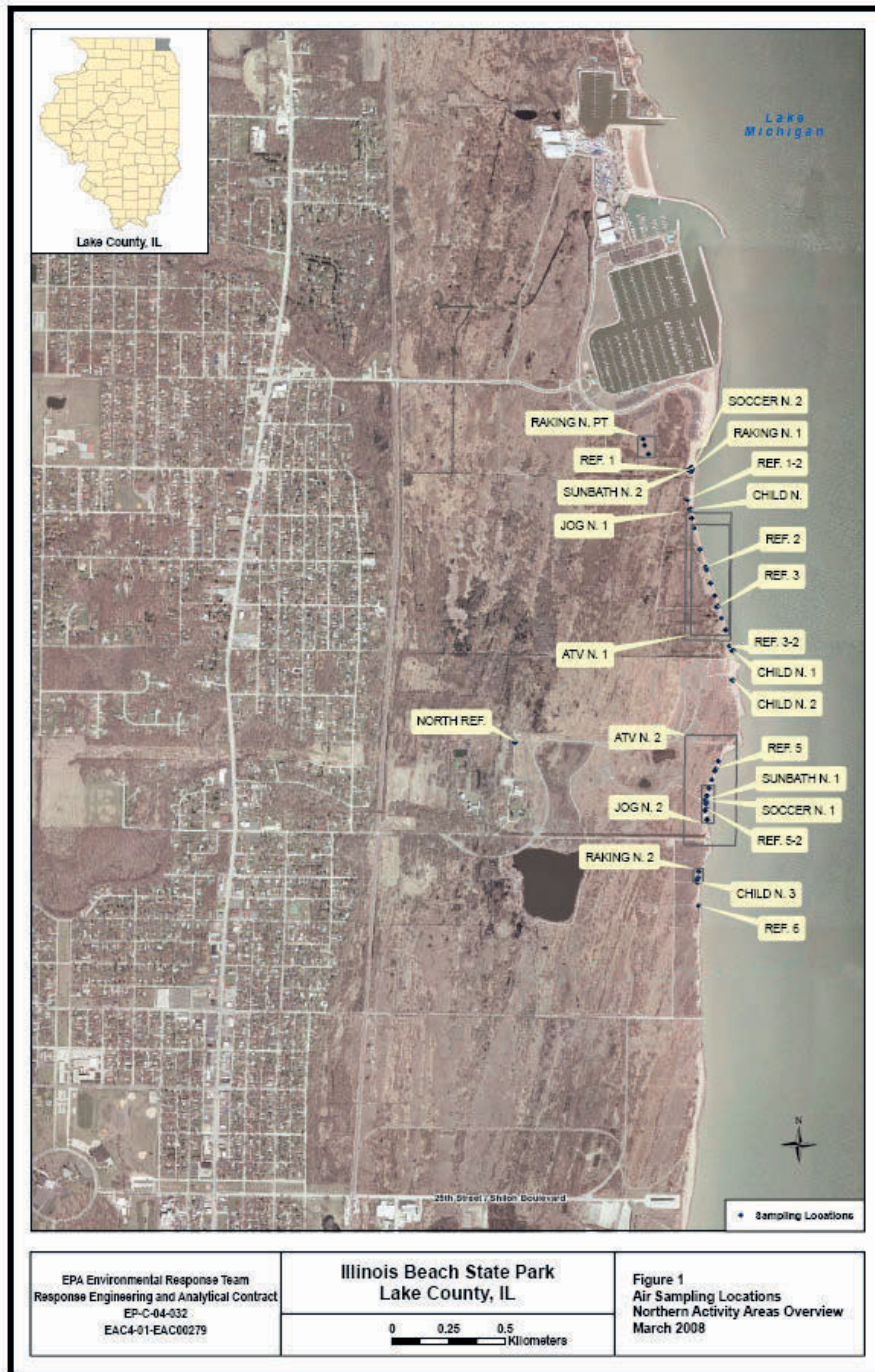
Figure 1: Overview of Air Sampling Locations-North Unit