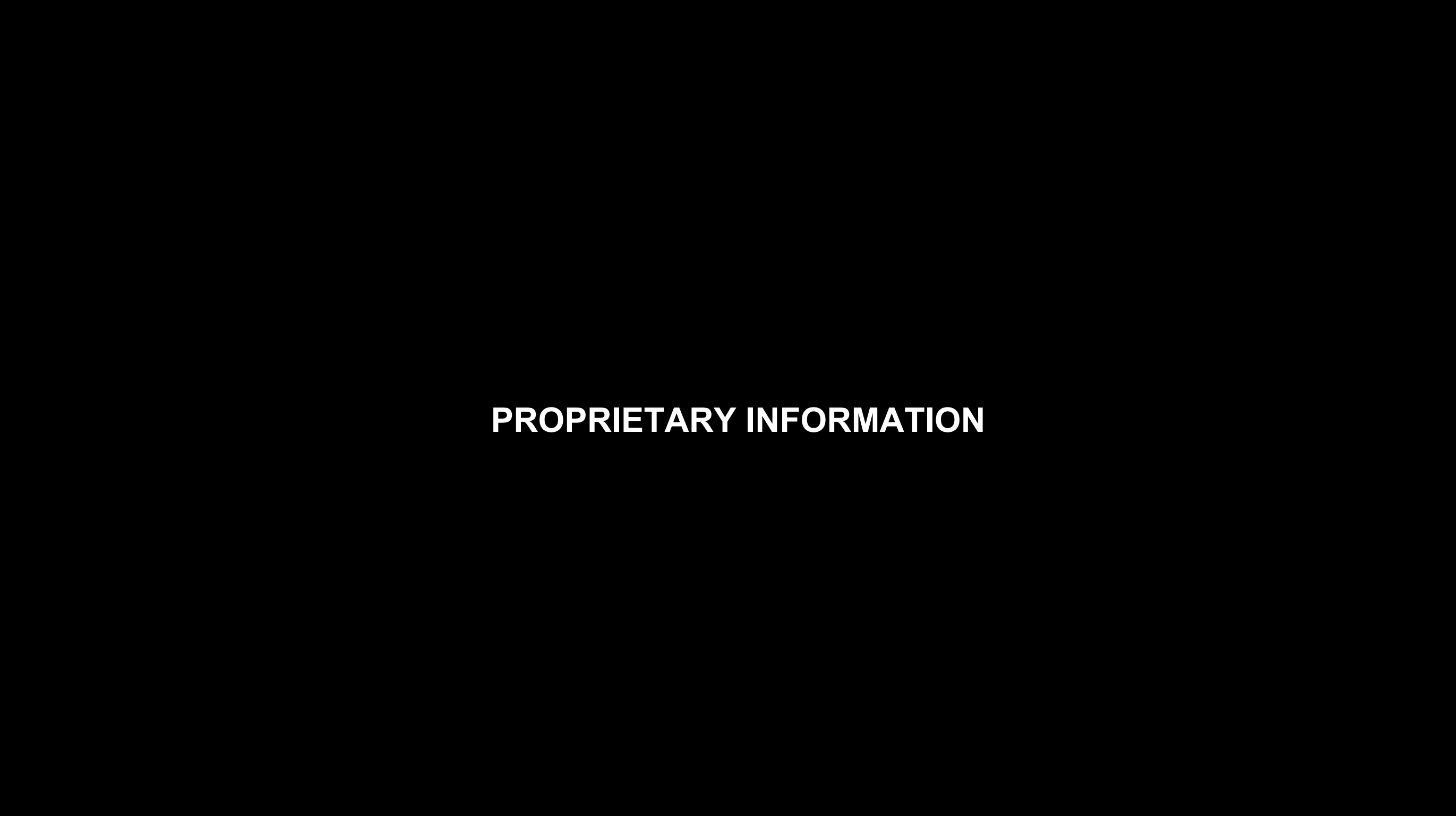
Figure 12.3-6 – Reactor Building Radiation Zone Map for Full Power and Shutdown Operation at Elevation 18100 mm