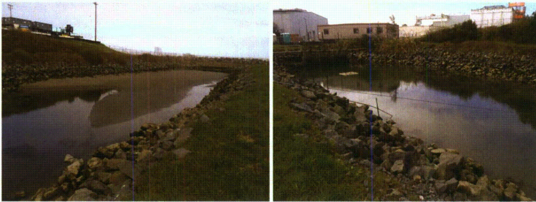
Figure 5. The discharge canal, looking toward the north end and outfall structure (left photo) and south view (right photo).

A section of the current coastal trail (Figure 6) that provides recreational access along the bay frontage will need to be temporarily closed to facilitate removal of the outfall structure. The contractor will install a cofferdam in Humboldt Bay to isolate the outfall structure work area from tidal and wave action, minimize construction-related effects on the bay, and provide a safe work environment. Prior to cofferdam installation, turbidity control structures (e.g., silt curtains) will be installed as needed in the bay outside of the cofferdam to keep turbidity within the levels required by the Water Quality Control Plan for the North Coast Region (i.e., less than 20% above background levels) (North Coast Regional Water Quality Control Board 2011). The contractor will then demolish and remove the concrete outfall structure and its four asbestos-bonded metal outfall pipes.