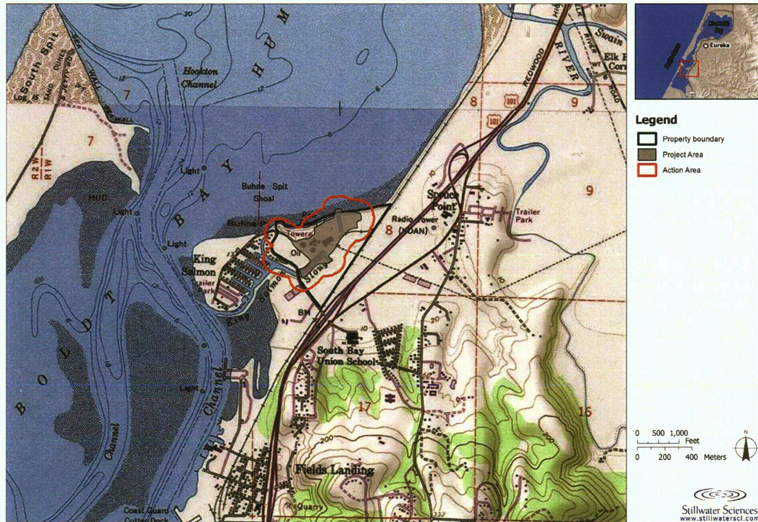
Figure 1. Project Area and Action Area.