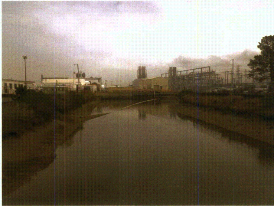
Figure 4. Intake canal work excavation area, located inside the floating boom. The intake structure is located at the far end of the canal.