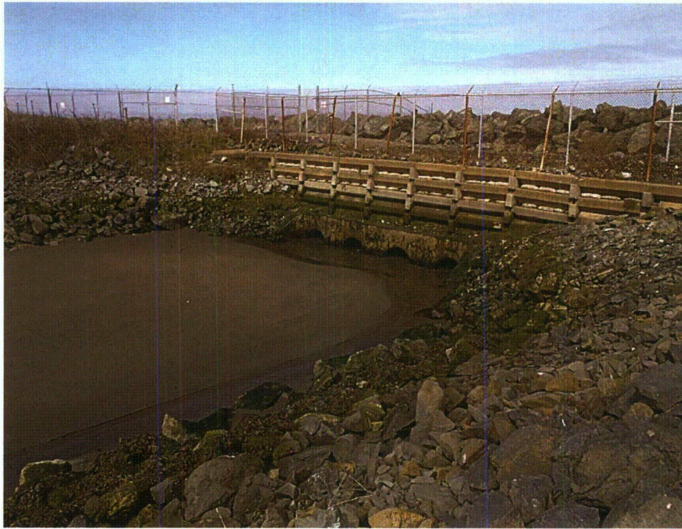
Figure 6. Discharge canal outfall structure. The Coastal Trail is located outside of the fence line along the top of the structure. Note the accumulated sediment filling the canal.