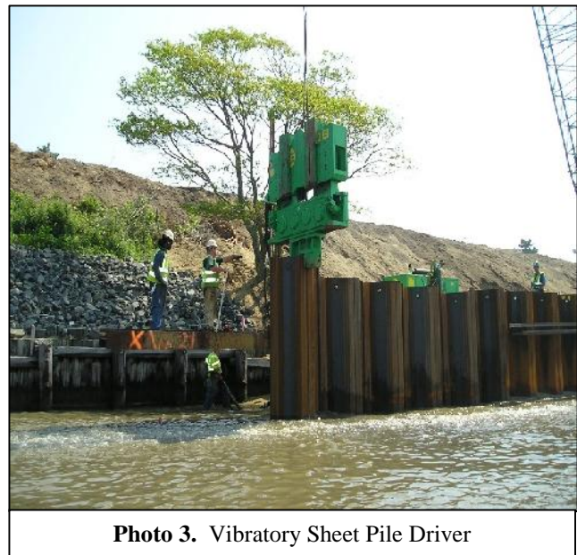
Photo 3. Vibratory Sheet Pile Driver

Unfortunately, the bubble curtain could not be turned off to perform a proper insertion loss measurement, so its noise reduction was measured using two hydrophones at once; one on each side of the bubble curtain while the pile driver was operating. The results indicated that the bubble curtain was providing only 3 to 4 decibels of noise reduction; however greater reduction could be expected with more airflow through the system. Similar measurements on both sides of the turbidity curtain were inconclusive; however the turbidity curtain was not expected to provide a measurable noise reduction across it as its purpose is to act as a physical barrier to keep fish and turtles away from the area and contain particulates within the construction zone.