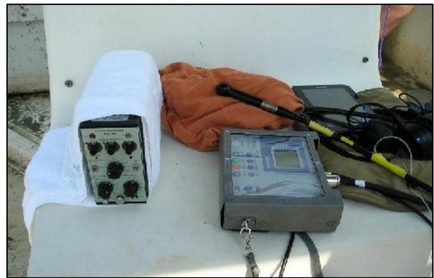
Photo 2. Underwater Noise Instrumentation

As shown in Photo 2, the transducers selected for this project were RESON TC-4033 hydrophones of nominal sensitivity -203 dB re: 1V/ \mu Pa (0.07 mV/Pa). The hydrophones had 20 meter (66 feet) integral cables, however water depth was not an issue on this project as the bay is only a few meters deep at any location. Being a charge device, the hydrophone's signal was first passed through a Brüel & Kjær 2635 charge amplifier so that it could be conditioned, filtered and amplified if needed. Then the AC signal was passed to a RION DA-20 data recorder to produce a waveform file in the field.