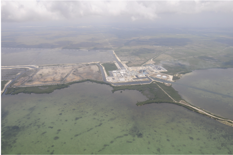
Looking west, Units 6 & 7 plant area shown to left, Units 1–5 shown to right