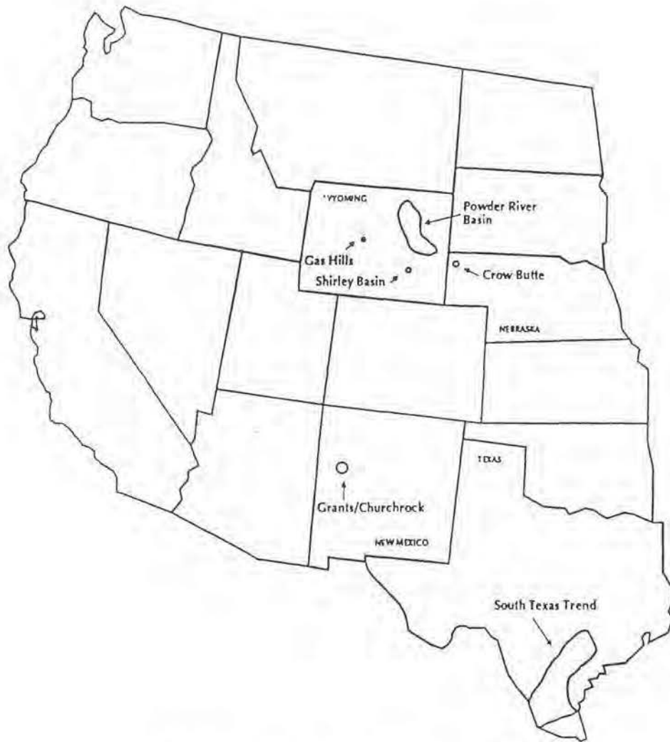
FIG. 2. In situ leach uranium mining districts.

kilometers and has been a prolific uranium producer. In the past several open pit and a few underground mines produced uranium, while today only the Highland and Christensen-Irigaray ISL mines are in production.