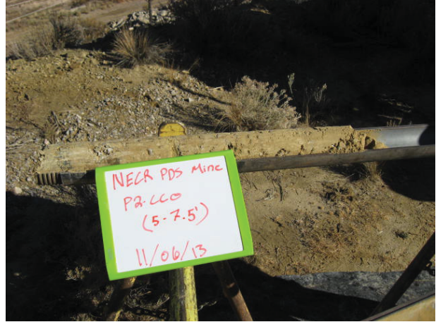
Pond 2 CC02 5-7.5' 11/6/13