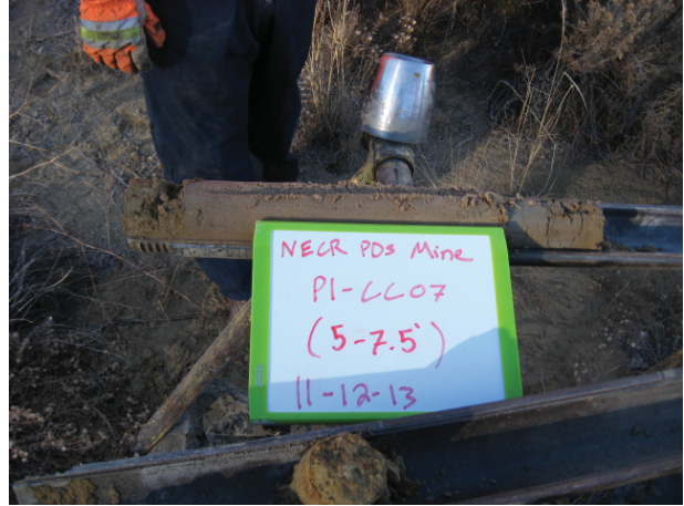
Pond 1 CC07 5-7.5' 11/12/13