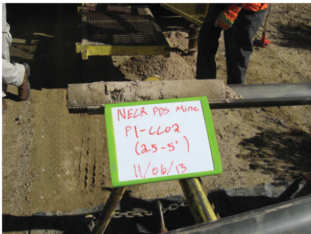
Pond 1 CC02 2.5-5' 11/6/13