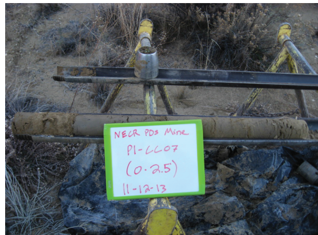
Pond 1 CC07 0-2.5' 11/12/13