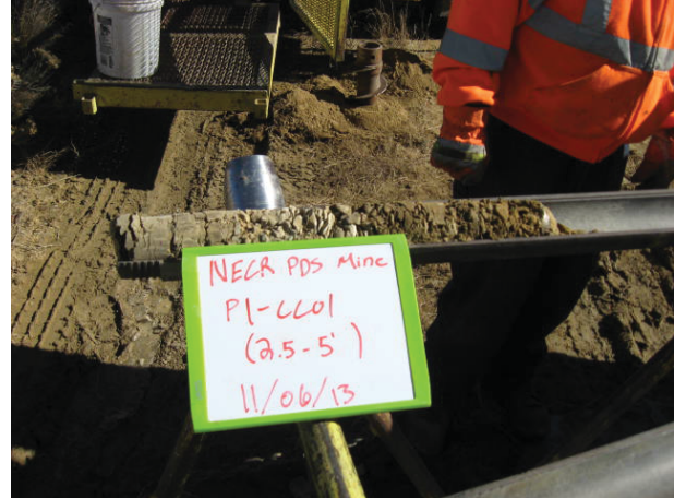
Pond 1 CC01 2.5-5' 11/6/13