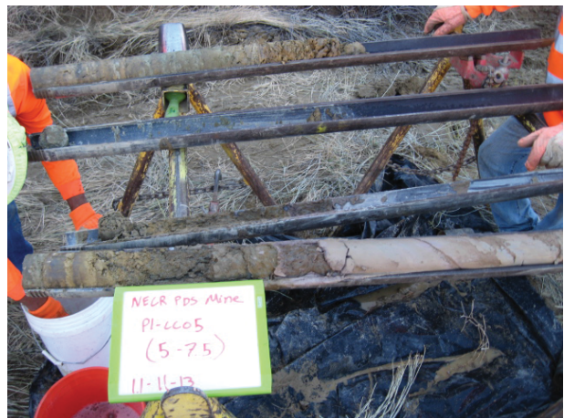
Pond 1 CC05 5-7.5' 11/11/13