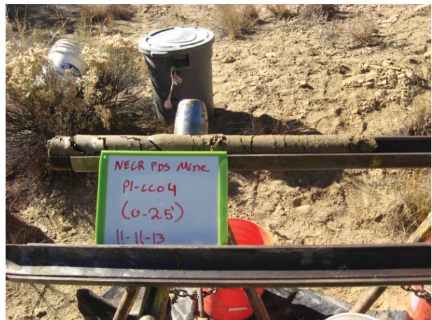
Pond 1 CC04 0-2.5' 11/11/13