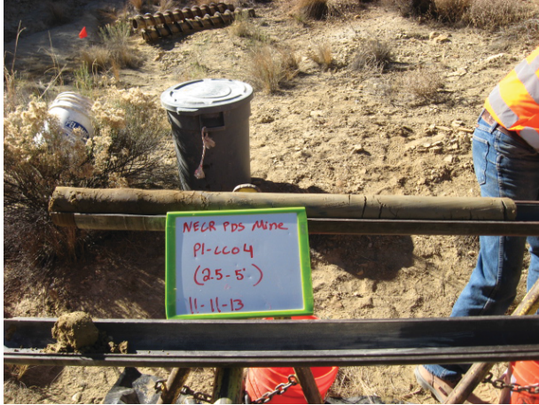
Pond 1 CC04 2.5-5' 11/11/13