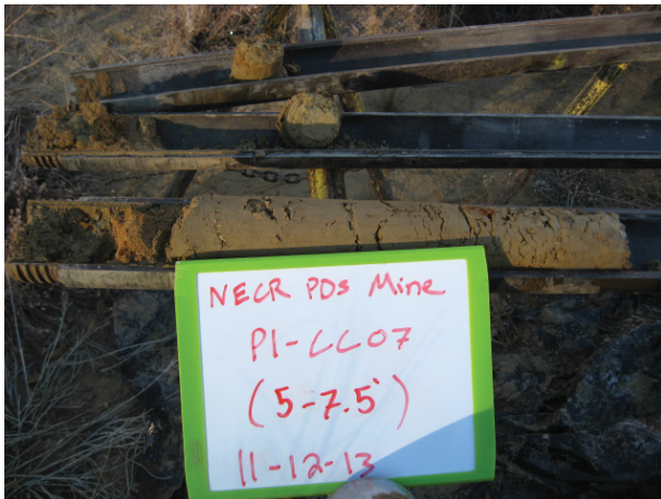
Pond 1 CC07 5-7.5' 11/12/13