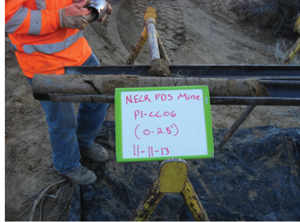
Pond 1 CC06 0-2.5' 11/11/13