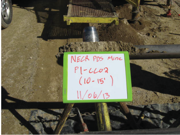
Pond 1 CC02 10-15' 11/6/13