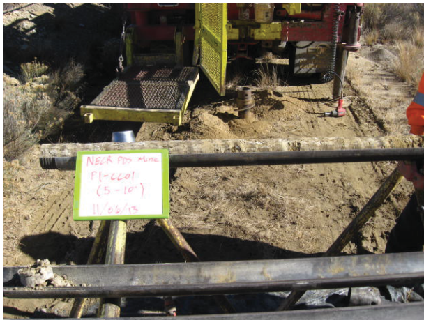
Pond 1 CC01 5-10' 11/6/13