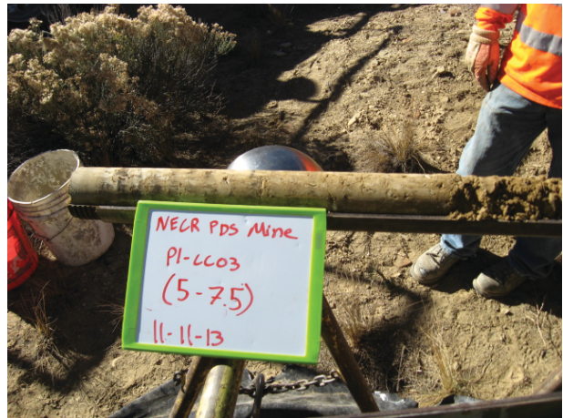
Pond 1 CC03 5-7.5' 11/11/13