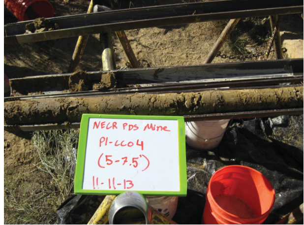
Pond 1 CC04 5-7.5' 11/11/13