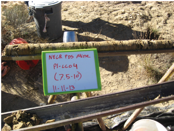
Pond 1 CC04 7.5-10' 11/11/13