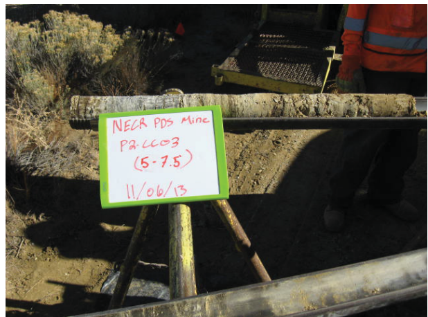
Pond 2 CC03 5-7.5' 11/6/13