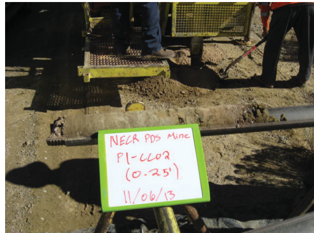
Pond 1 CC02 0-2.5' 11/6/13