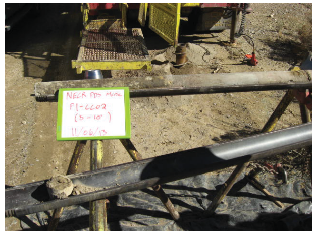
Pond 1 CC02 5-10' 11/6/13