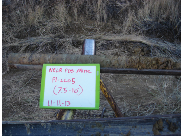
Pond 1 CC05 7.5-10' 11/11/13