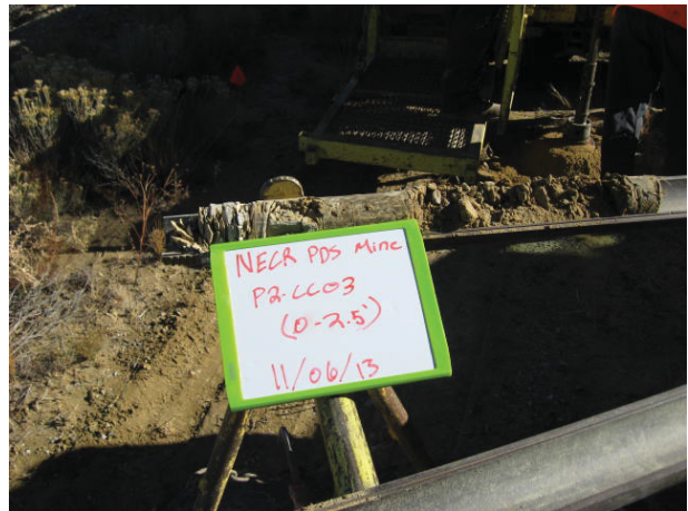
Pond 2 CC03 0-2.5' 11/6/13