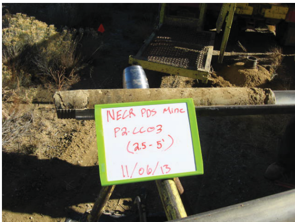
Pond 2 CC03 2.5-5' 11/6/13