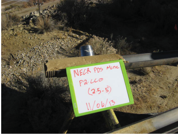
Pond 2 CC02 2.5-5' 11/6/13