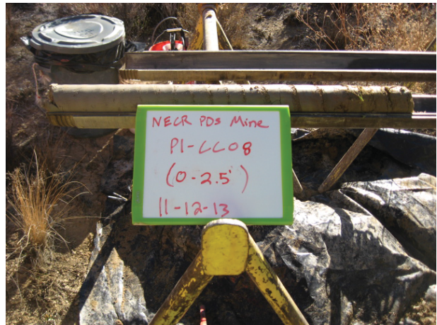
Pond 1 CC08 0-2.5' 11/12/13