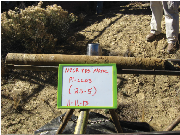
Pond 1 CC03 2.5-5' 11/11/13