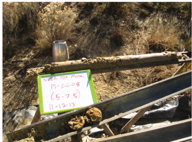
Pond 1 CC08 5-7.5' 11/12/13