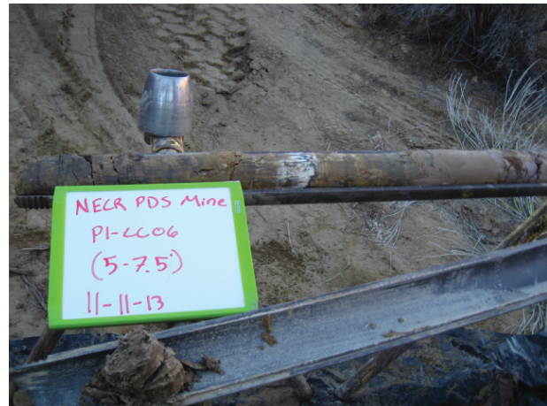
Pond 1 CC06 5-7.5' 11/11/13