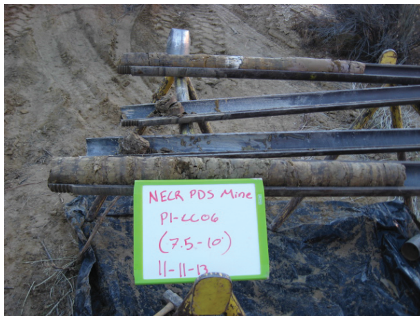
Pond 1 CC06 7.5-10' 11/11/13