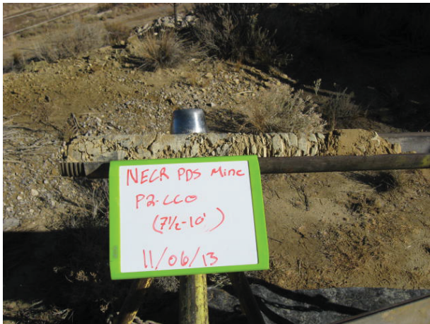
Pond 2 CC02 7.5-10' 11/6/13