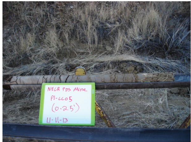
Pond 1 CC05 0-2.5' 11/11/13