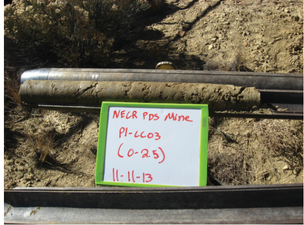
Pond 1 CC03 0-2.5' 11/11/13