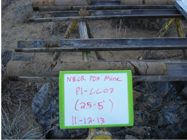
Pond 1 CC07 2.5-5' 11/12/13