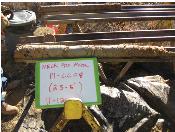
Pond 1 CC08 2.5-5' 11/12/13