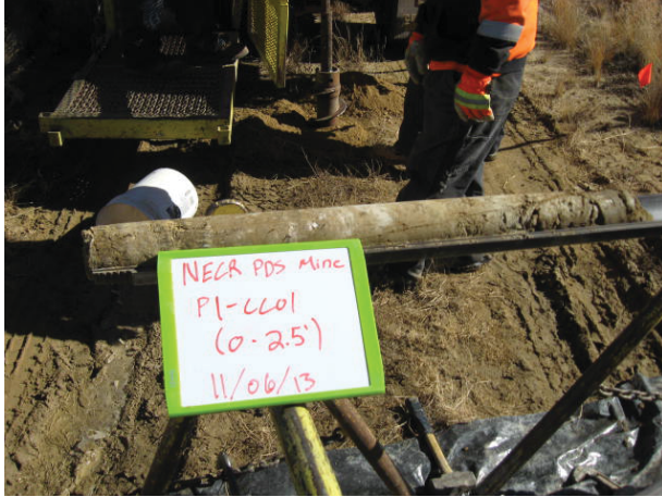
Pond 1 CC01 0-2.5' 11/6/13