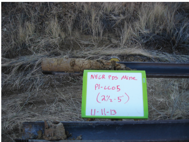
Pond 1 CC05 2.5-5' 11/11/13