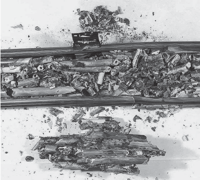
Figure 1. Zirconium Fuel Rod Simulators that Incurred Runaway Oxidation