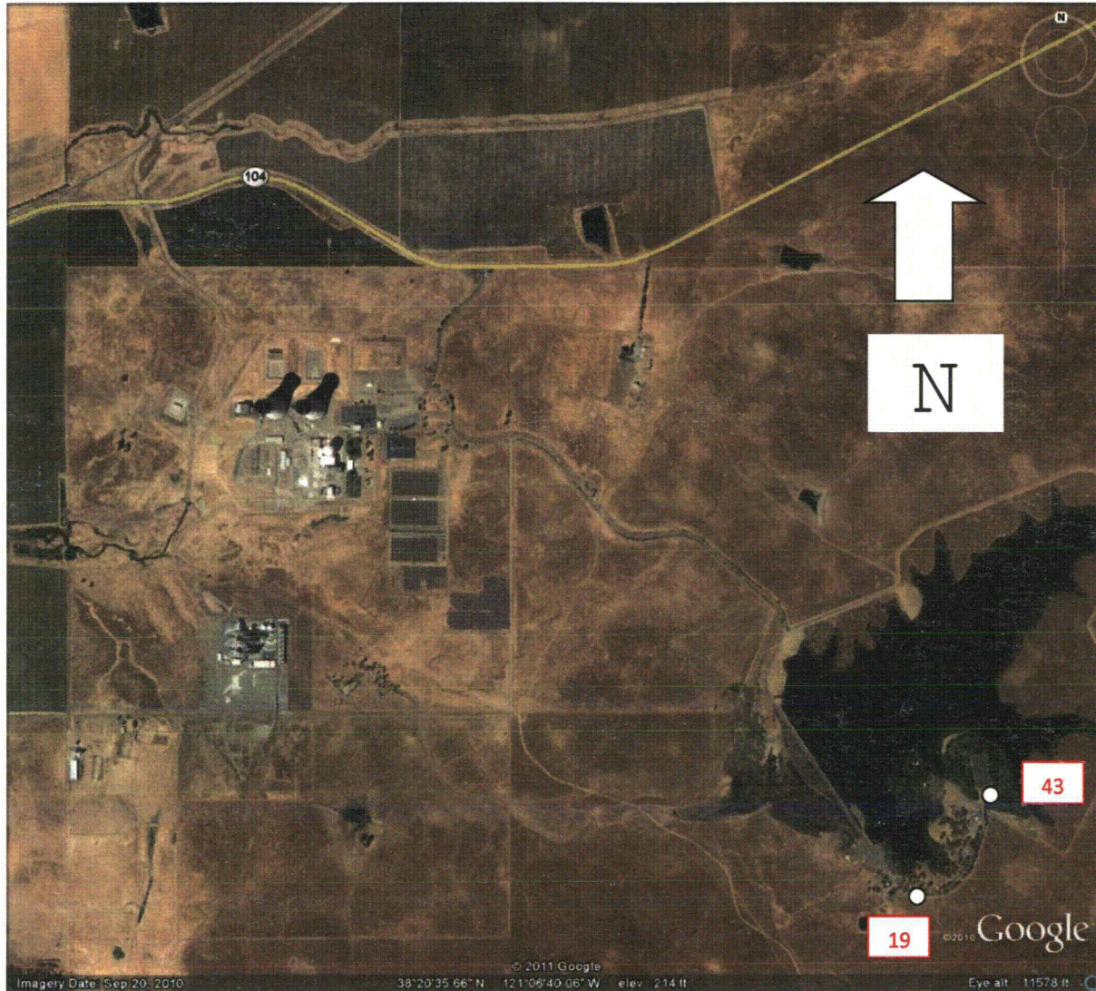
Figure B-2 Radiological Environmental Control Locations