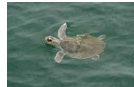
Kemp's Ridley Turtle ( Lepidochelys kempii)

Nesting also occurs in Veracruz, Mexico, and in Texas, but on a much smaller scale. Occasional nesting has been documented in North Carolina, South Carolina, and Florida.