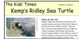
Kids' Times: Kemp's Ridley [pdf]

The Kemp's ridley has experienced a historical, dramatic decrease in arribada size. An amateur video from 1947 documented an extraordinary Kemp's ridley arribada near Rancho Nuevo. It has been estimated that approximately 42,000 Kemp's ridleys nested during that single day! The video also provided evidence of Kemp's ridley egg collection. Dozens of villagers are seen on the beach excavating the nests and subsequent interviews have suggested that 80% of the nests, about 33,000, were collected and transported to local villages (Hildebrand, 1963).