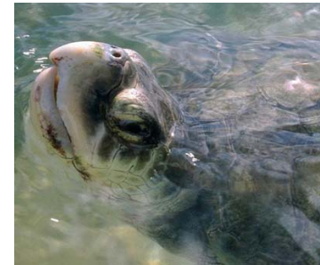
Kemp's Ridley Turtle (Lepidochelys kempii)

There are many theories on what triggers an arribada, including offshore winds, lunar cycles, and the release of pheromones by females. Scientists have yet to conclusively determine the cues for ridley arribadas. Arribada nesting is a