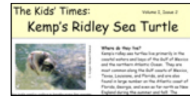
Kids' Times: Kemp's Ridley [pdf]

Kemp's ridley turtles are protected by various international treaties and agreements. They are listed in Appendix I of the Convention on International Trade in Endangered Species of Wild Flora and Fauna ( CITES ), which means that international trade of this species is prohibited. Kemp's ridleys are listed in Appendices I and II of the Convention on Migratory Species ( CMS ). Kemp's ridleys are also protected under Annex II of the Specially Protected Areas and Wildlife ( SPA ) Protocol of the Cartagena Convention. Additionally, the U.S. is a party to the Inter-American Convention for the Protection and Conservation of Sea Turtles ( IAC ), which is the only binding international treaty dedicated exclusively to marine turtles.