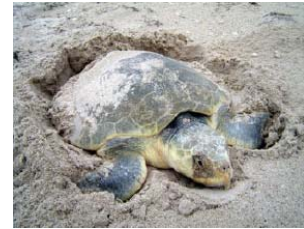
Kemp's Ridley Turtle ( Lepidochelys kempii )

• Natural Resource Damage Assessment (NRDA)