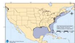
Kemp's Ridley Range Map (click for larger view PDF)