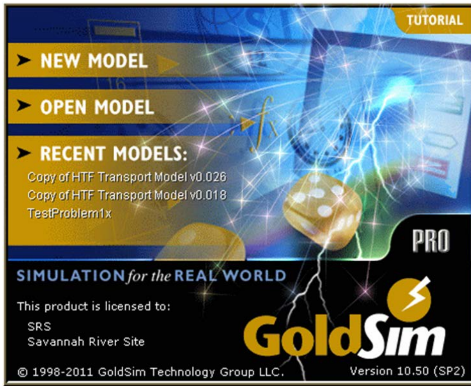
Figure 4.5-2: GoldSim© Test Problem Model File