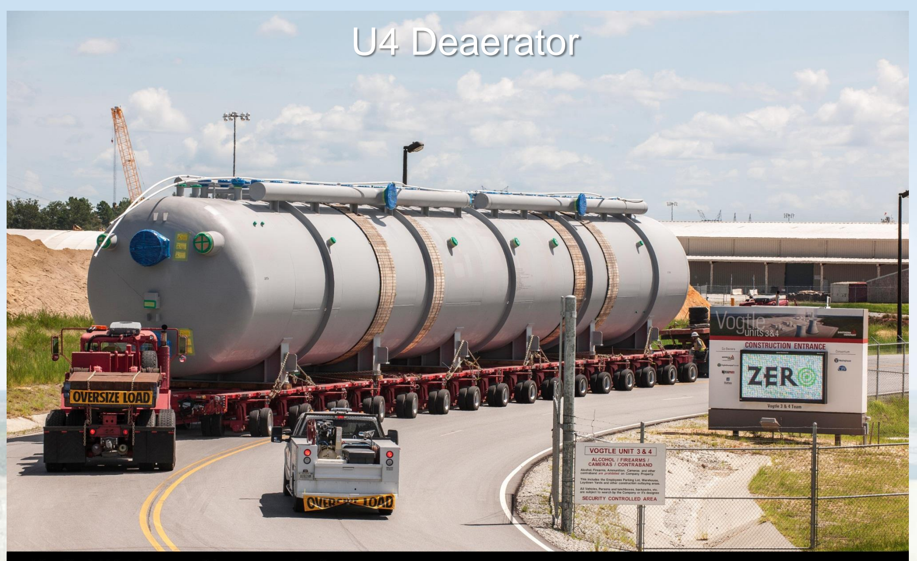
Plant Vogtle Unit 4 deaerator arriving to construction site