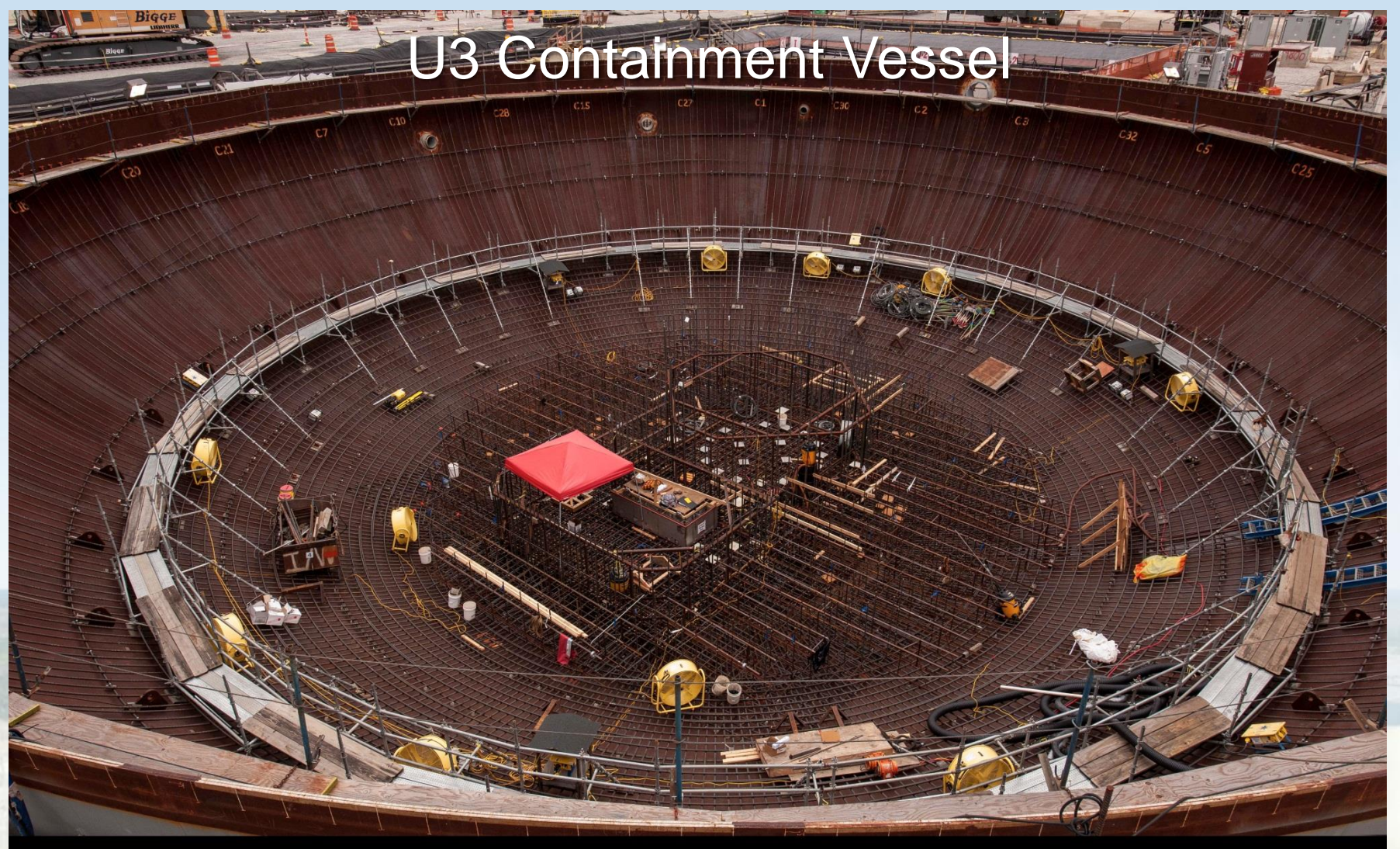
Plant Vogtle Unit 3 containment vessel bottom head, located inside nuclear island