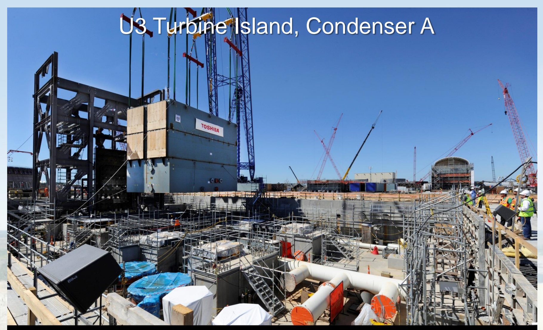
Plant Vogtle Unit 3 Condenser A Lower Shell is placed into the Unit 3 Turbine Island