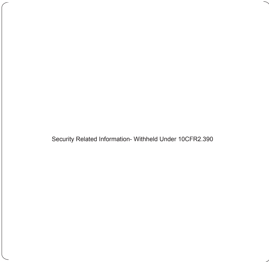
Figure 3-7 Containment Nodes at EL. 136' – 0"