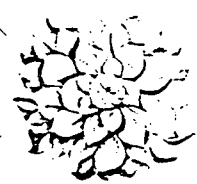
Dahlia USA 18c

Nuclear Regulatory Commission Washington, D.C 20555 Attn: San Onofre Licensing Proceedings