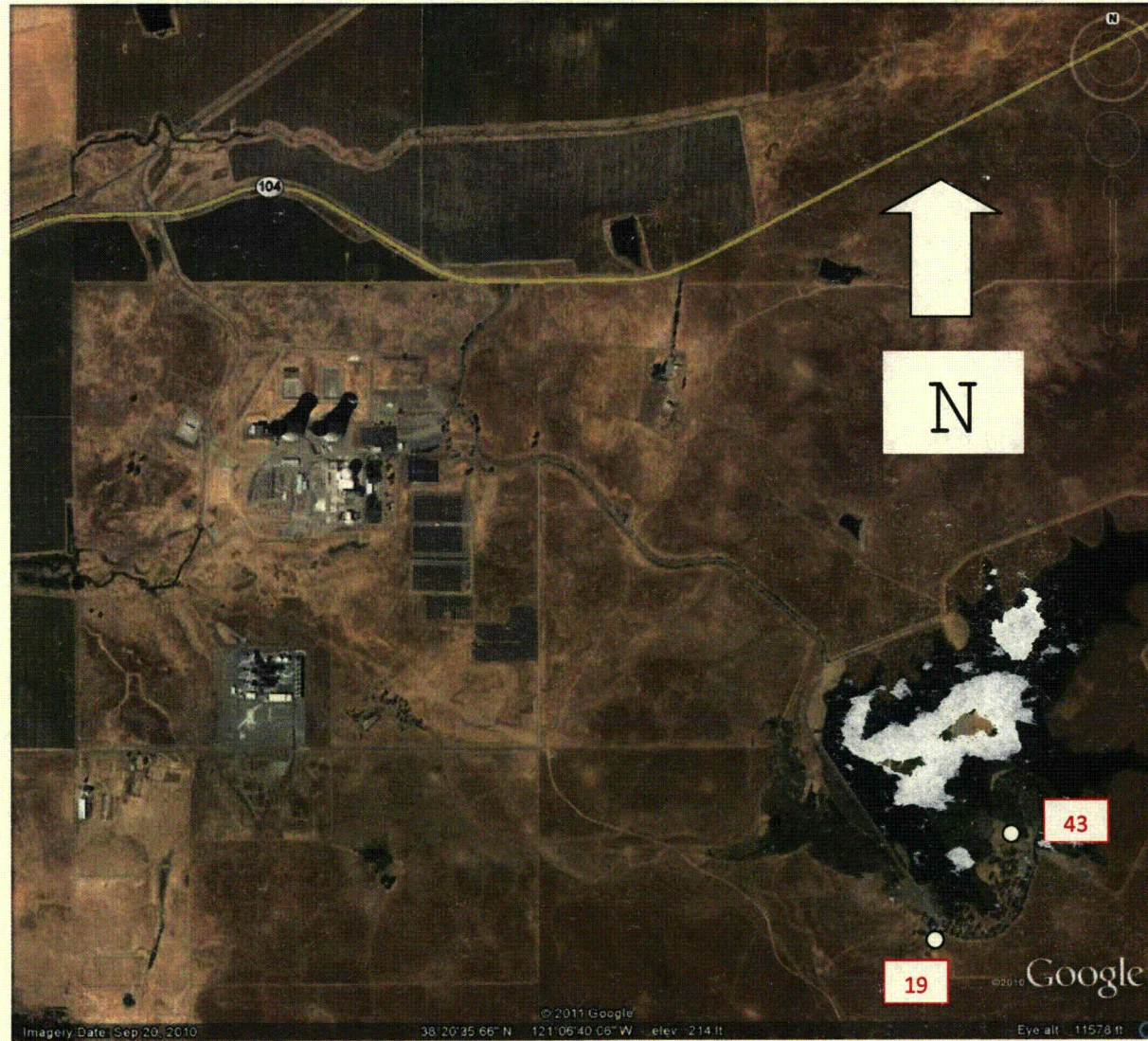
Figure B-2 Radiological Environmental Control Locations